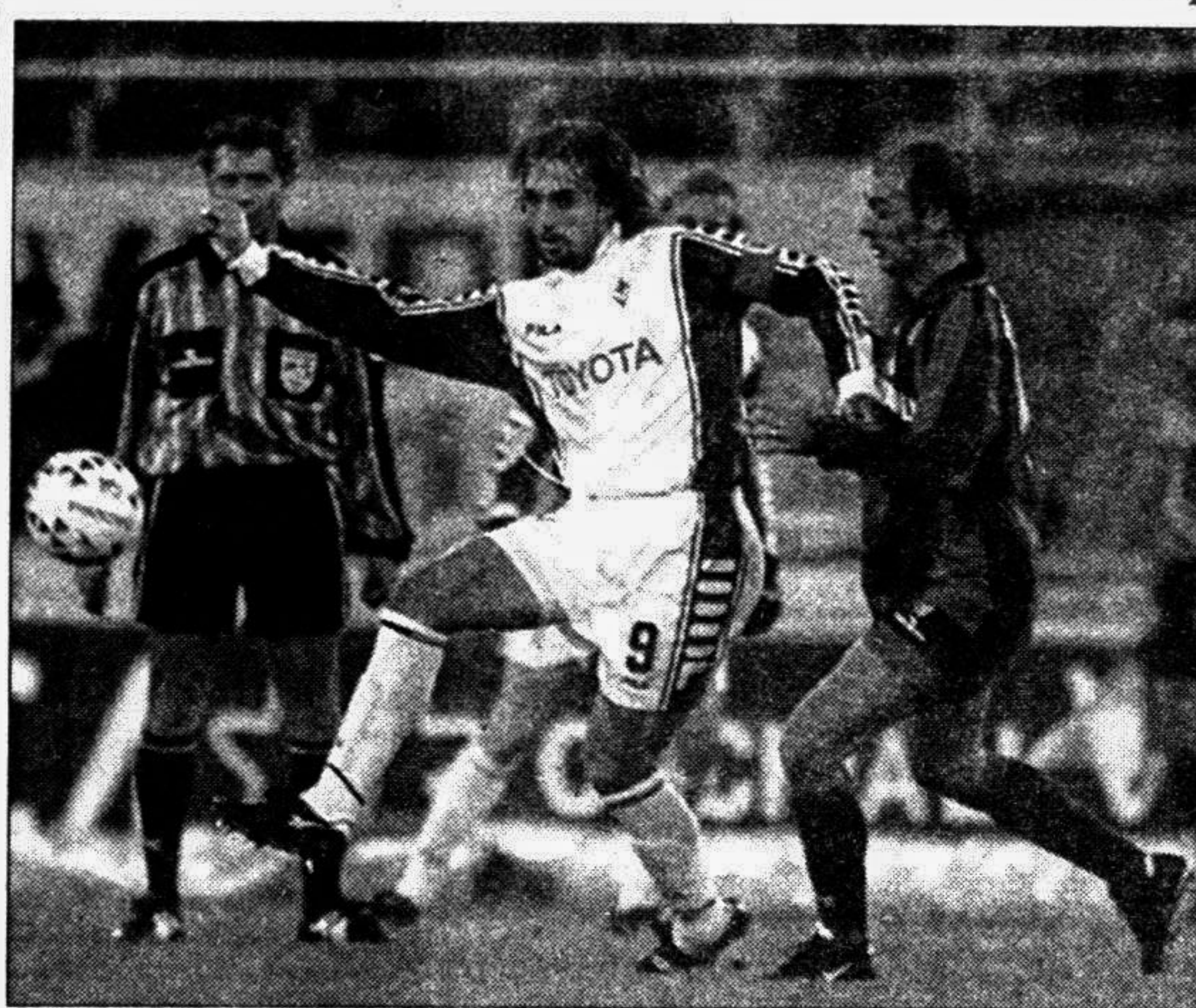
Gabriel Batistuta (C), Fiorentina's Argentine superstar, trying to break free from Bologna defender Giulio Falcone (R) during their Serie A match at Bologna on November 27.

Ding fought off a fierce challenge from Poland's Agata Wrobel, who claimed the silver with 280 kilos and a world record in the snatch with 127.5 kilos. Ding later matched the 127.5, but finished second in the snatch on higher body weight.