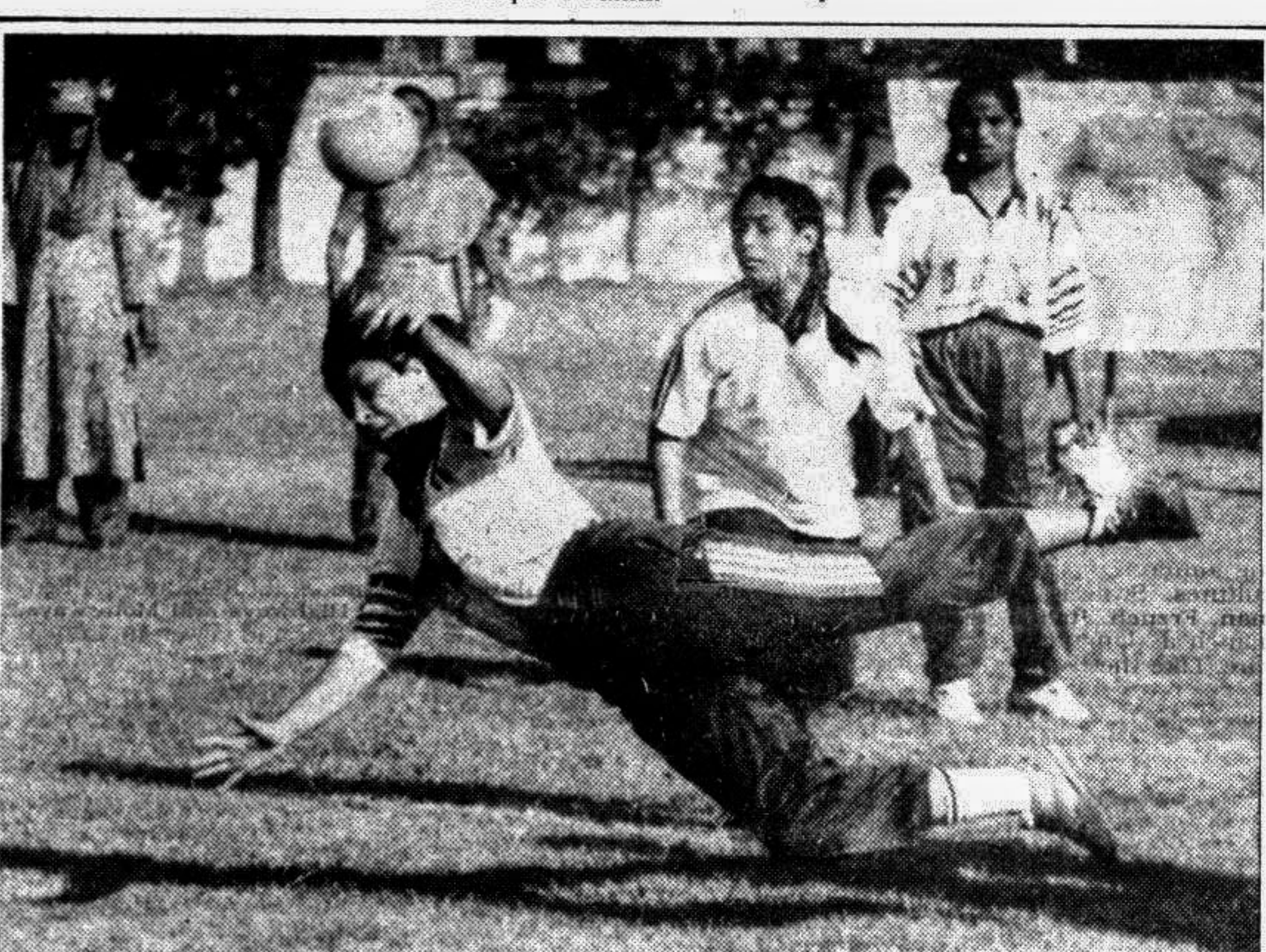
Action from yesterday's Sheetal women's handball league action between KNK School and Arambagh Krira Sangha played at the Sultana Kamal Women's Sports Complex.