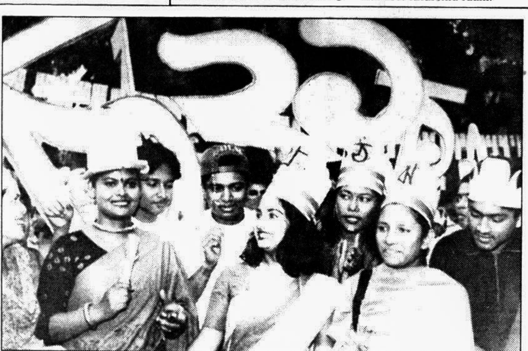
Members of the Sammilita Sangskritik Jote brought out a colourful procession in the city yesterday hailing UNESCO's declaration of February 21 as International Mother Language Day.