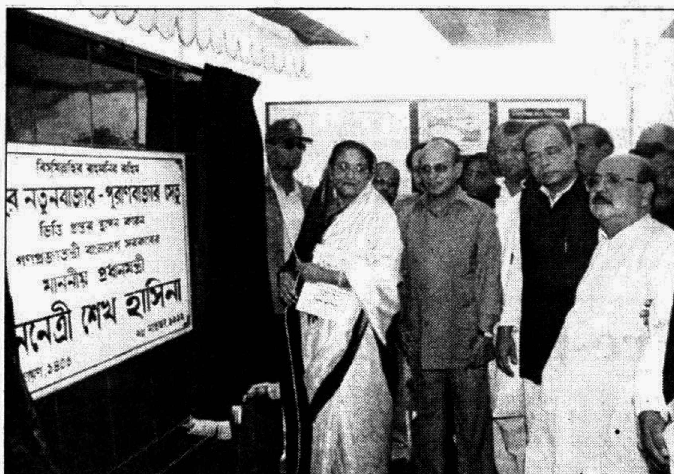
Prime Minister Sheikh Hasina yesterday laid the foundation of a bridge to link Natun Bazar and Pura Bazar in Chandpur town.