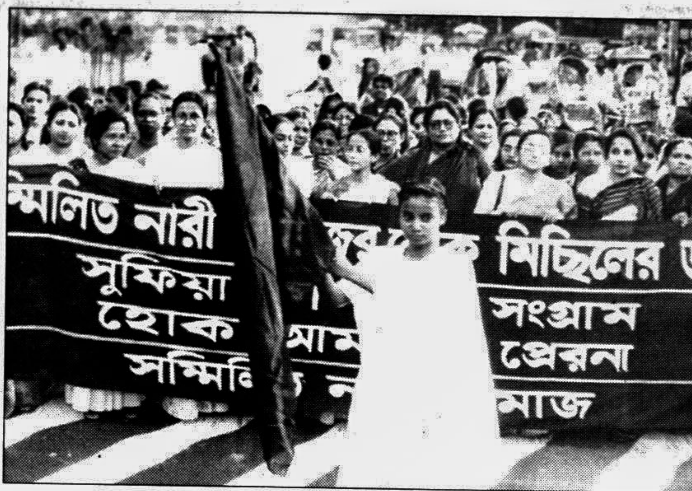
Sammilito Nari Samaj (SNS) brought out a mourning procession in the city yesterday in memory of poet Begum Sufia Kamal.

Meanwhile, BNP Secretary General Abdul Mannan Bhuiyan has said the statement made by Roushan Ershad will not make any dent in the alliance or harm the opposition movement.