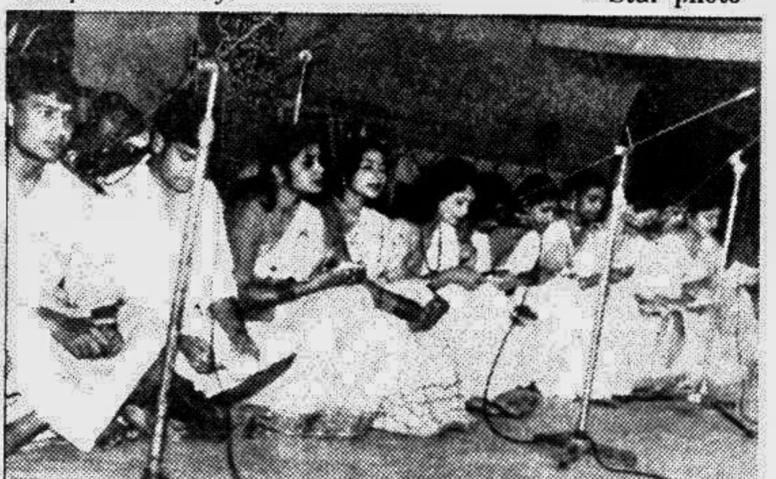
Artists of a cultural organisation in Rangpur redering 'Bhaway' songs recently at the three-day long Abbas Uddin fair in the district town.