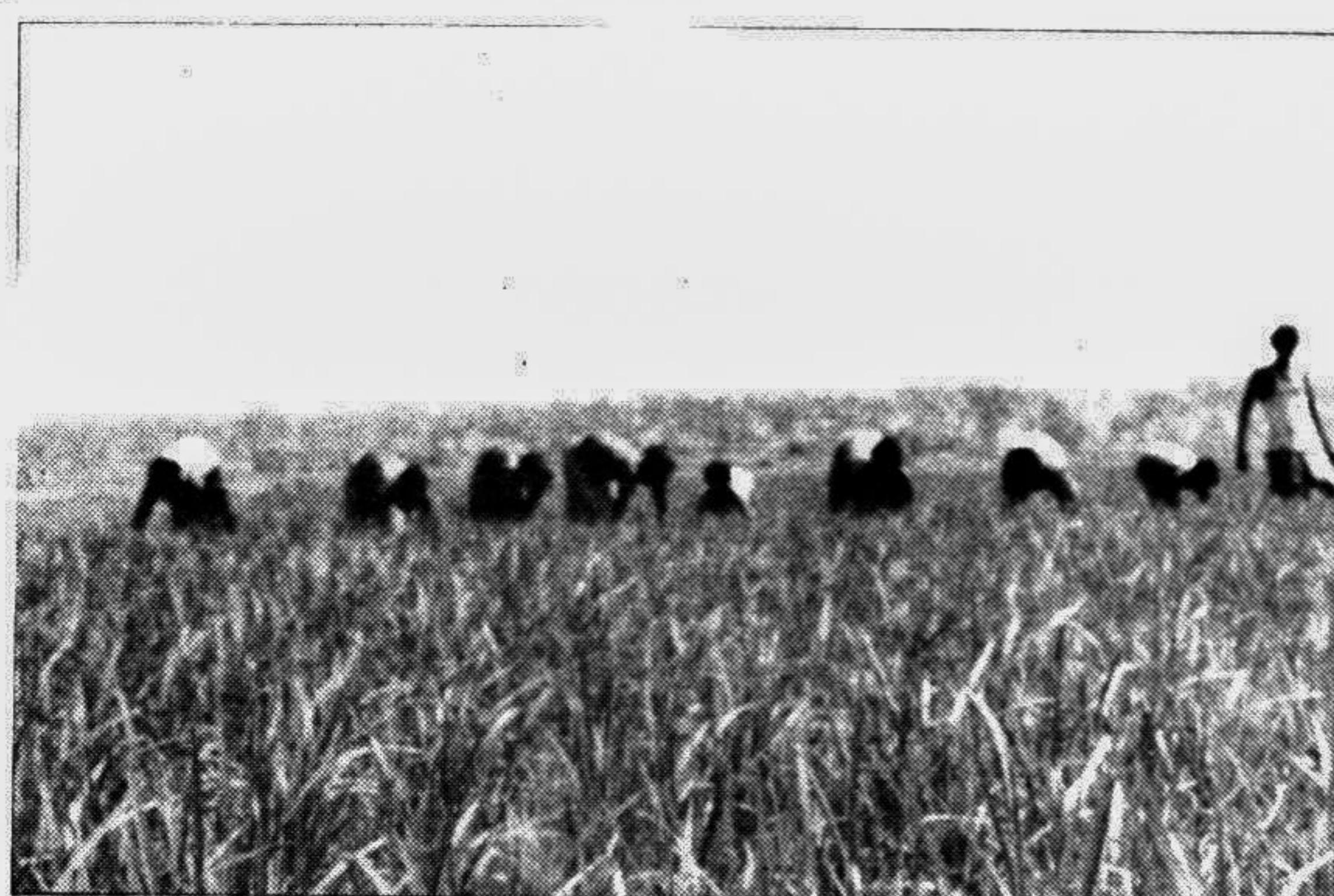
Farmers working at a disputed shoal land full of paddy in Barisal.

A very tense situation is prevailing now at Chatkimara and Chair Sitaram under sadar thana of Bhola where at any time bloody clashes may take place.