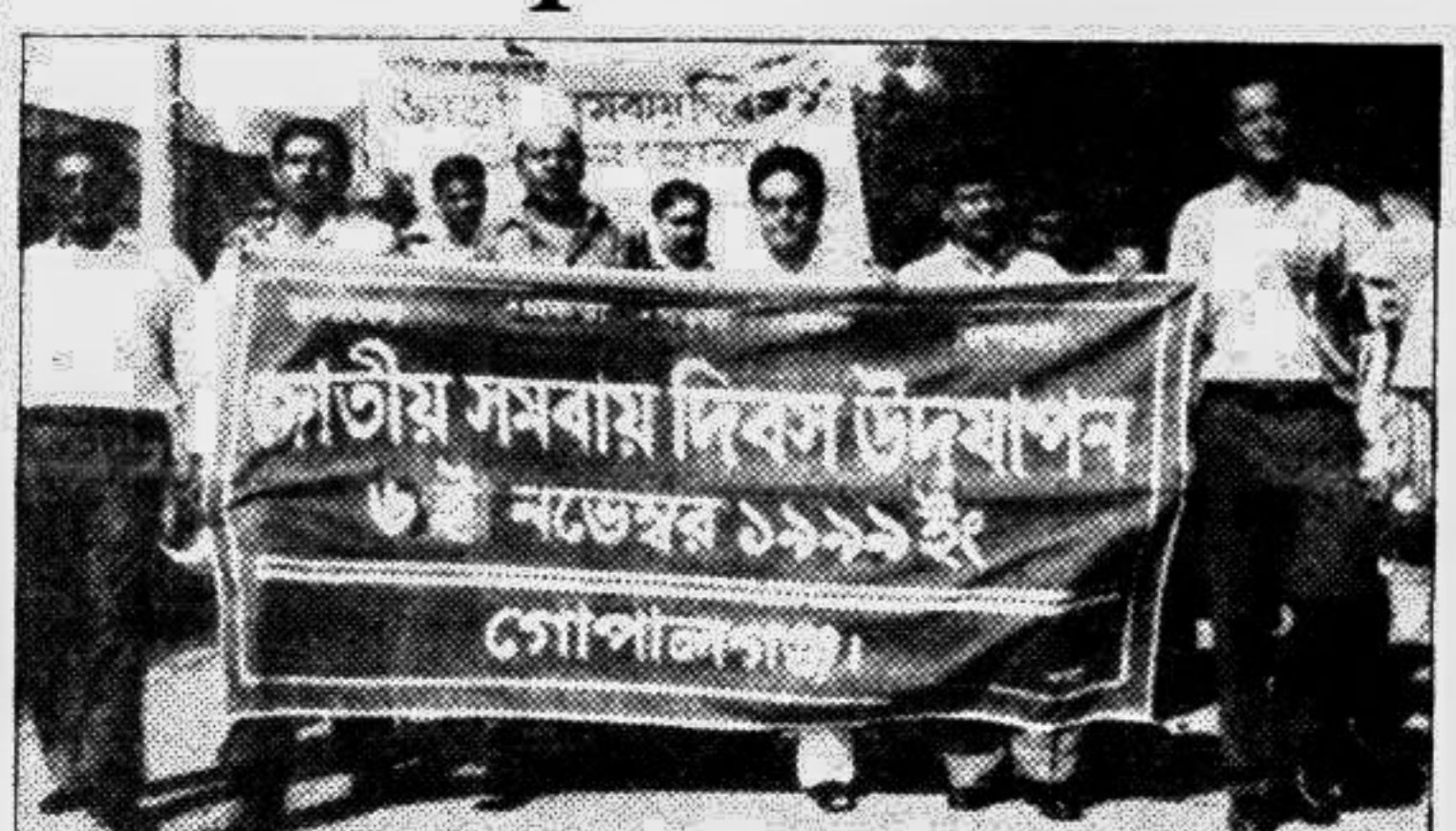
A procession was brought out in Gopalganj town recently on the occasion of the 28th National Cooperative Day.