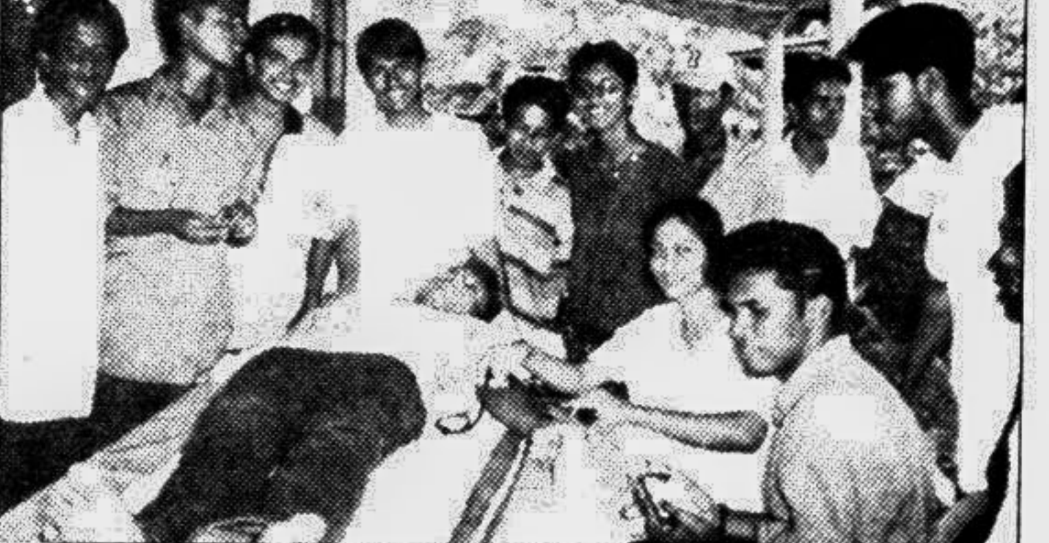
A student of Government Yasin College in Faridpur donating blood at a blood donation campaign organised jointly recently by Faridpur Medical College and Faridpur Interact Club.