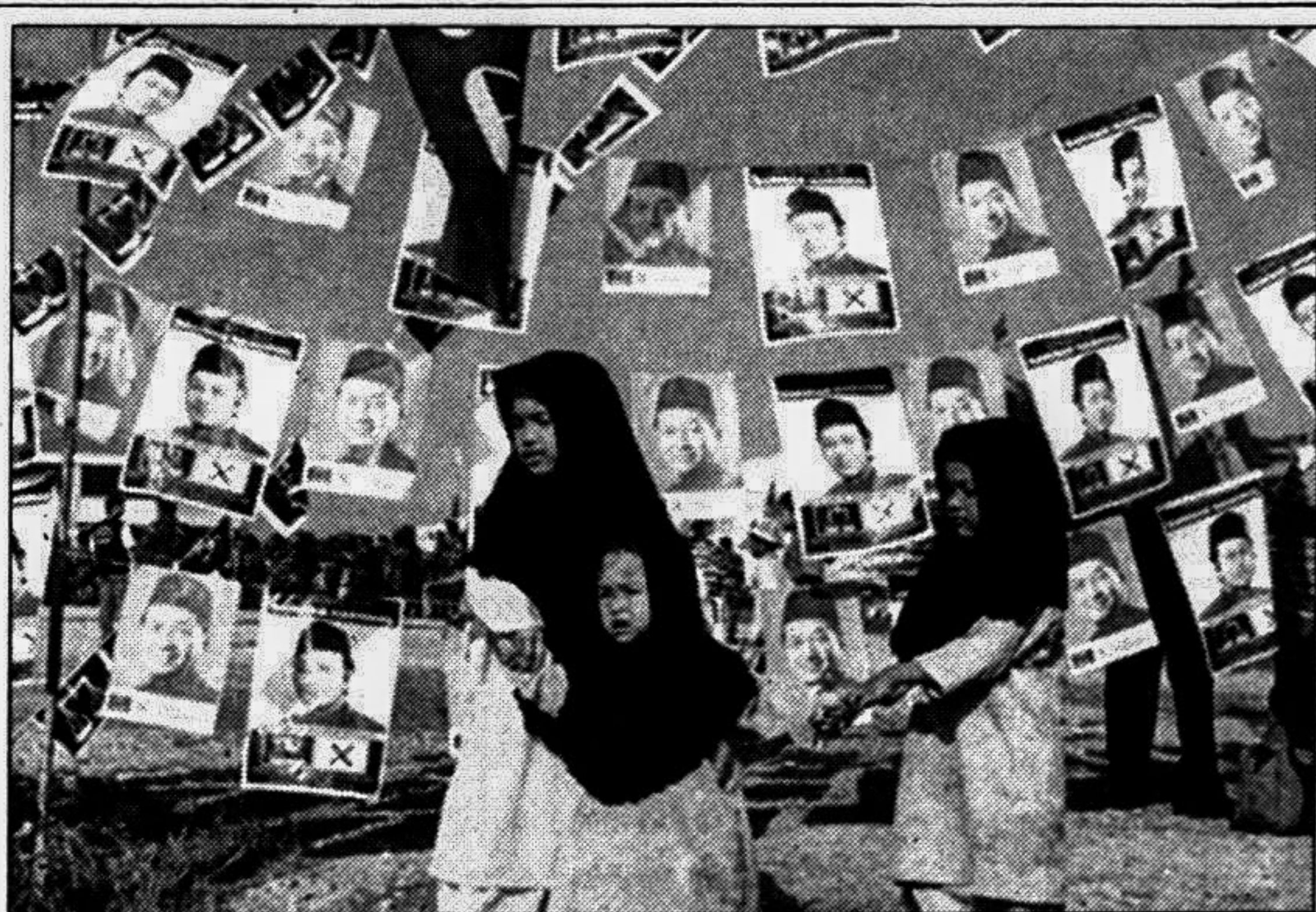
Children walk past posters of prime minister Mahathir Mohamad yesterday at Pekan Tanah Merah, in Mahathir's home state of Kedah, Malaysia goes to general elections today.