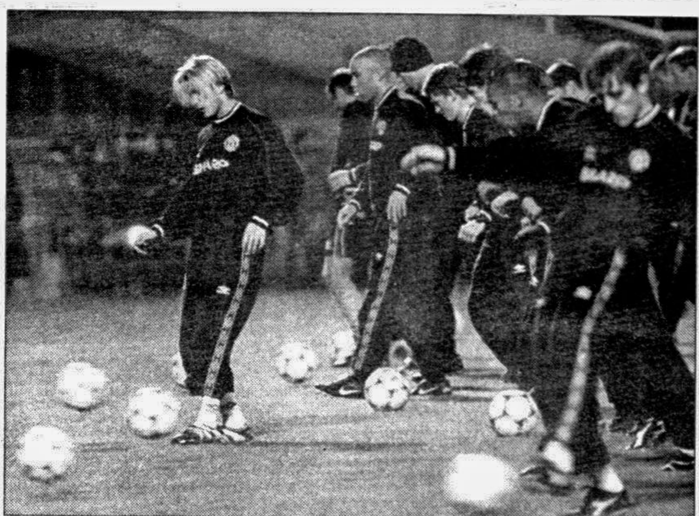
Manchester United players train at a Tokyo stadium yesterday ahead of their Intercontinental Cup final clash against Palmeiras.

The battered squad came under fire at the work out from a couple of hundred Benfica diehards upset at the woe of the heaviest suffered by Benfica in European competition.