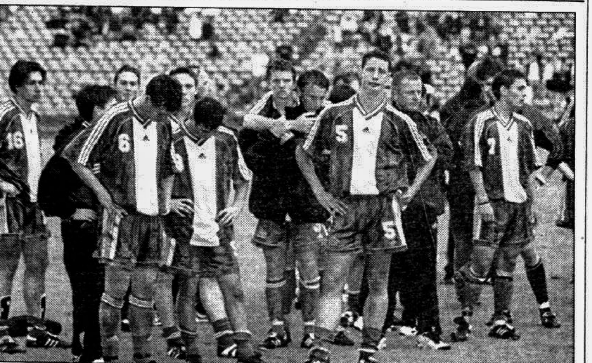
Players of the Australian U-17 football team are in a state of shock after losing to Brazil in the World Youth Championship final in Auckland yesterday.