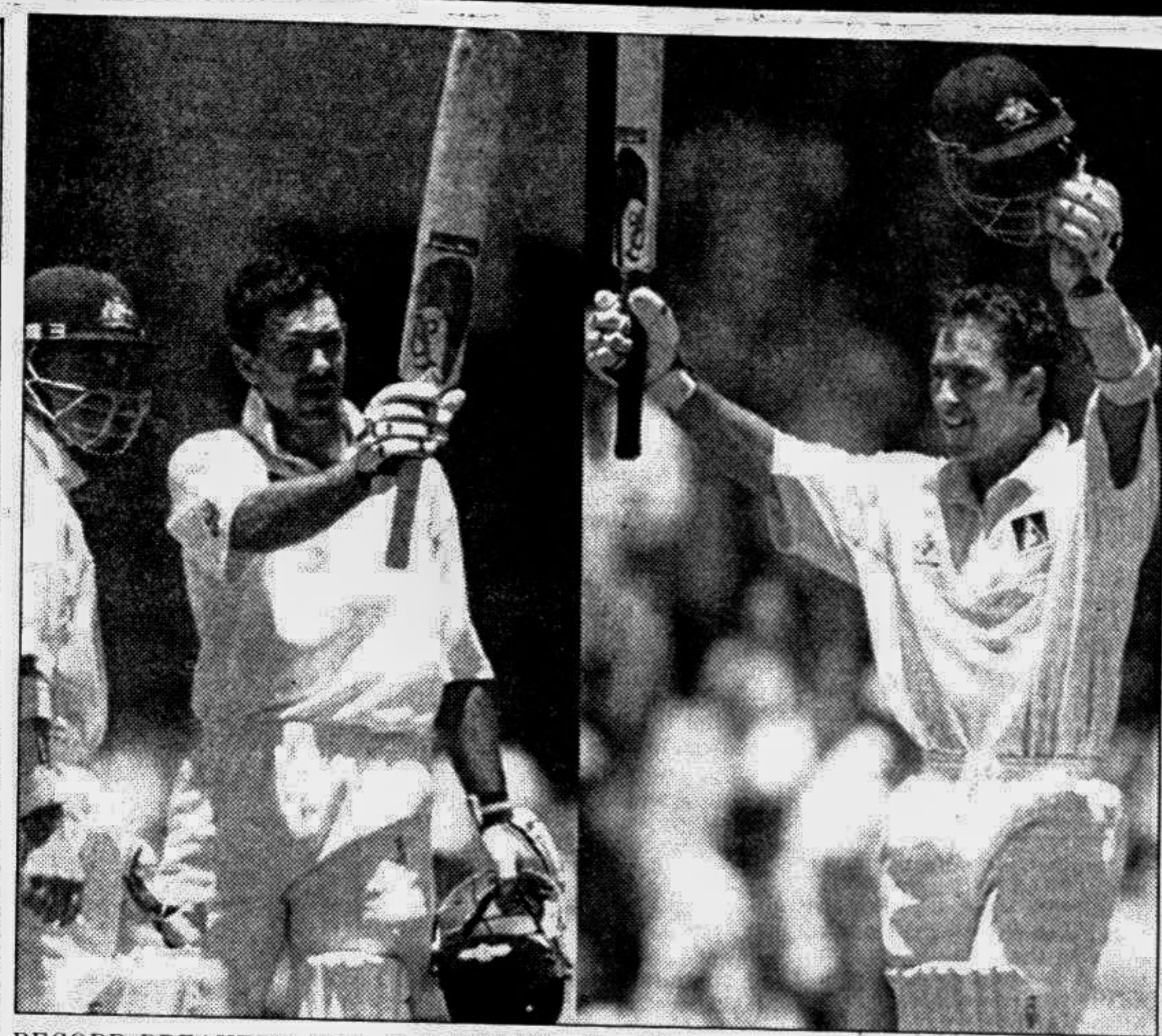
RECORD BREAKERS: Australia's Ricky Ponting (L) and Justin Langer, who featured in a record stand against Pakistan, acknowledge to the crowd after reaching their respective centuries at the WACA yesterday.

Bowler: O M R W Etee 7 3 12 0 Sadhin 2 1 5 0 Sagor 5 0 18 1 Sumon 24 6 39 2 Tariqul 3 1 13 0 Hira 21 8 28 3