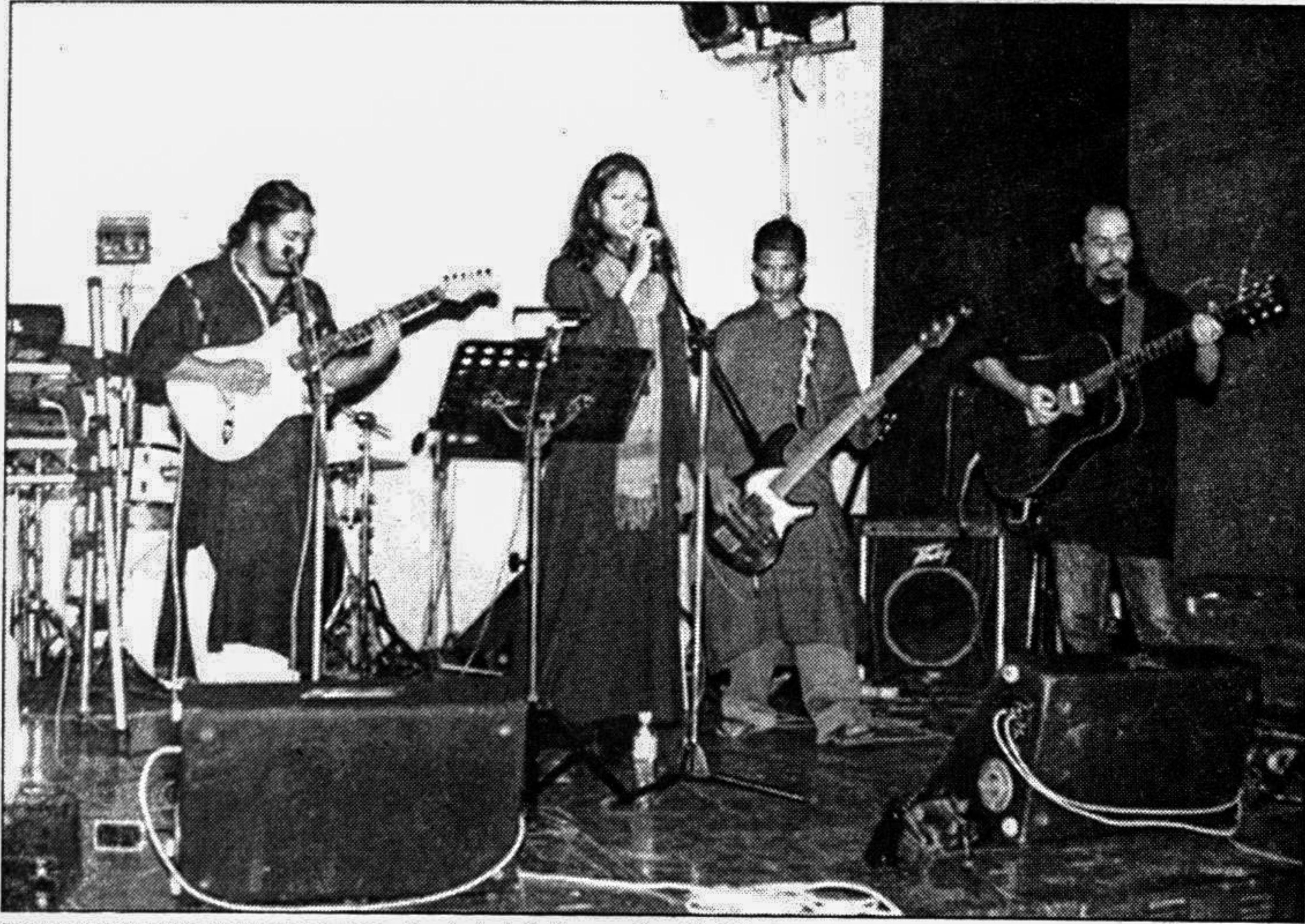
Bangla performing at the charity concert organized to raise funds for the excavation of the killing fields of '71.

Concert for the Liberation War Museum's Excavation of the Killing Fields