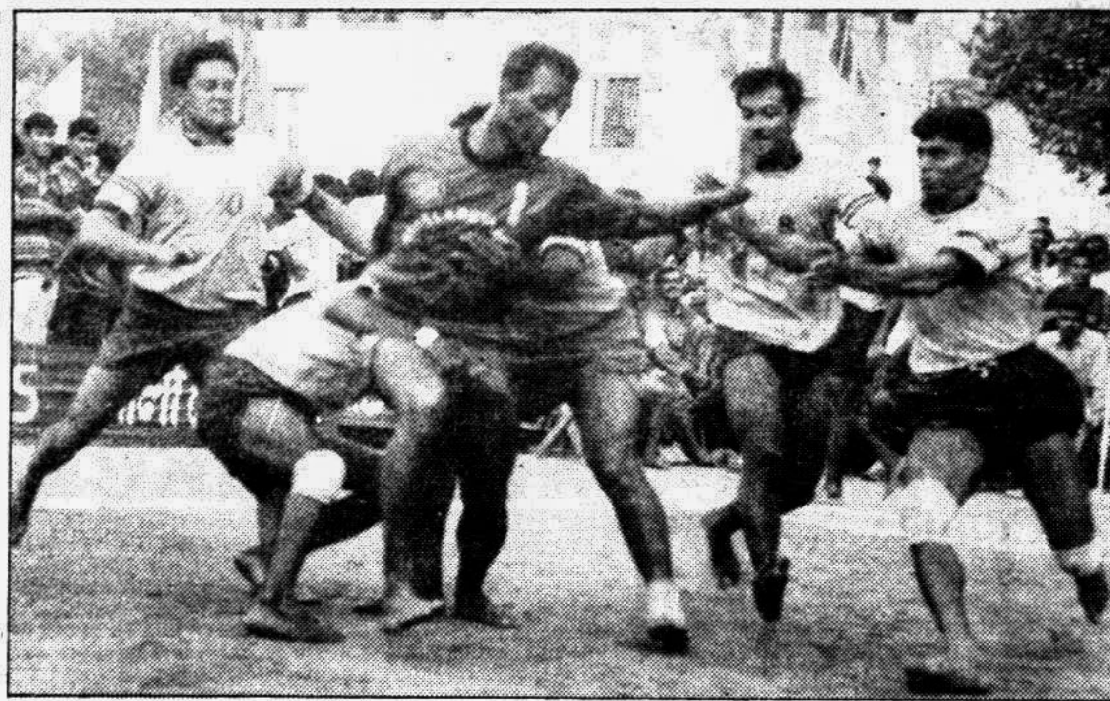
A moment from the national kabadi clash between Bangladesh Army and Tangail.