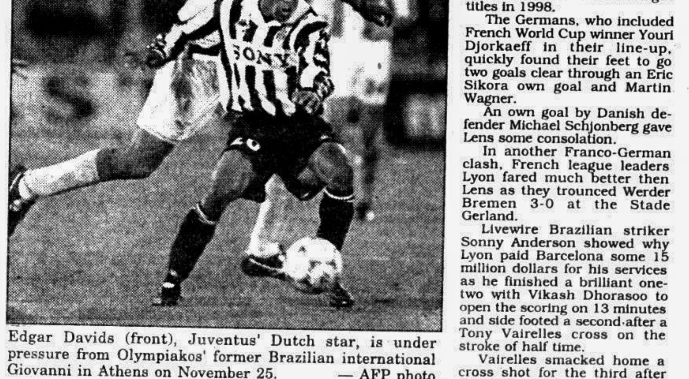
Edgar Davids (front), Juventus' Dutch star, is under pressure from Olympiakos' former Brazilian international Giovanni in Athens on November 25.

Rangers will travel to Dortmund with high hopes of reaching the quarter-finals and making up for Champions League exits after defeats by Bayern Munich and Valencia.