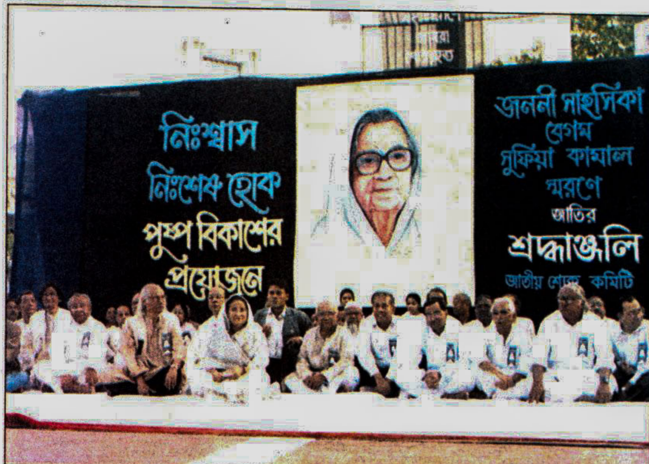
Prime Minister Sheikh Hasina along with members of National Mourning Committee at the Central Shaheed Minar yesterday.