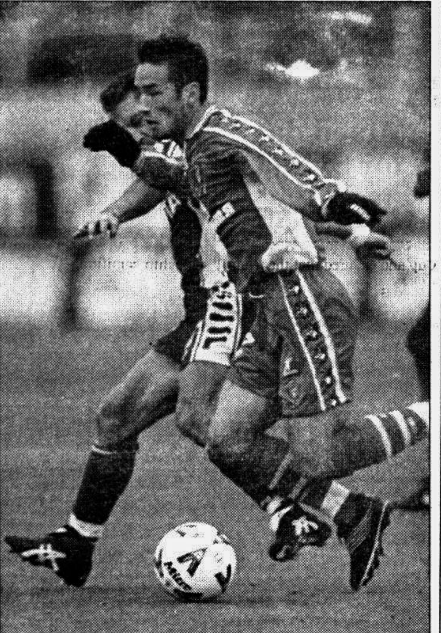
Perugia's Japanese playmaker Hidetoshi Nakata (R) trying to get the better of a Fiorentina defender during their Serie A encounter at Florence on November 20.

"Anyway," he joked, "Manchester United will be less bothersome than Perugia."