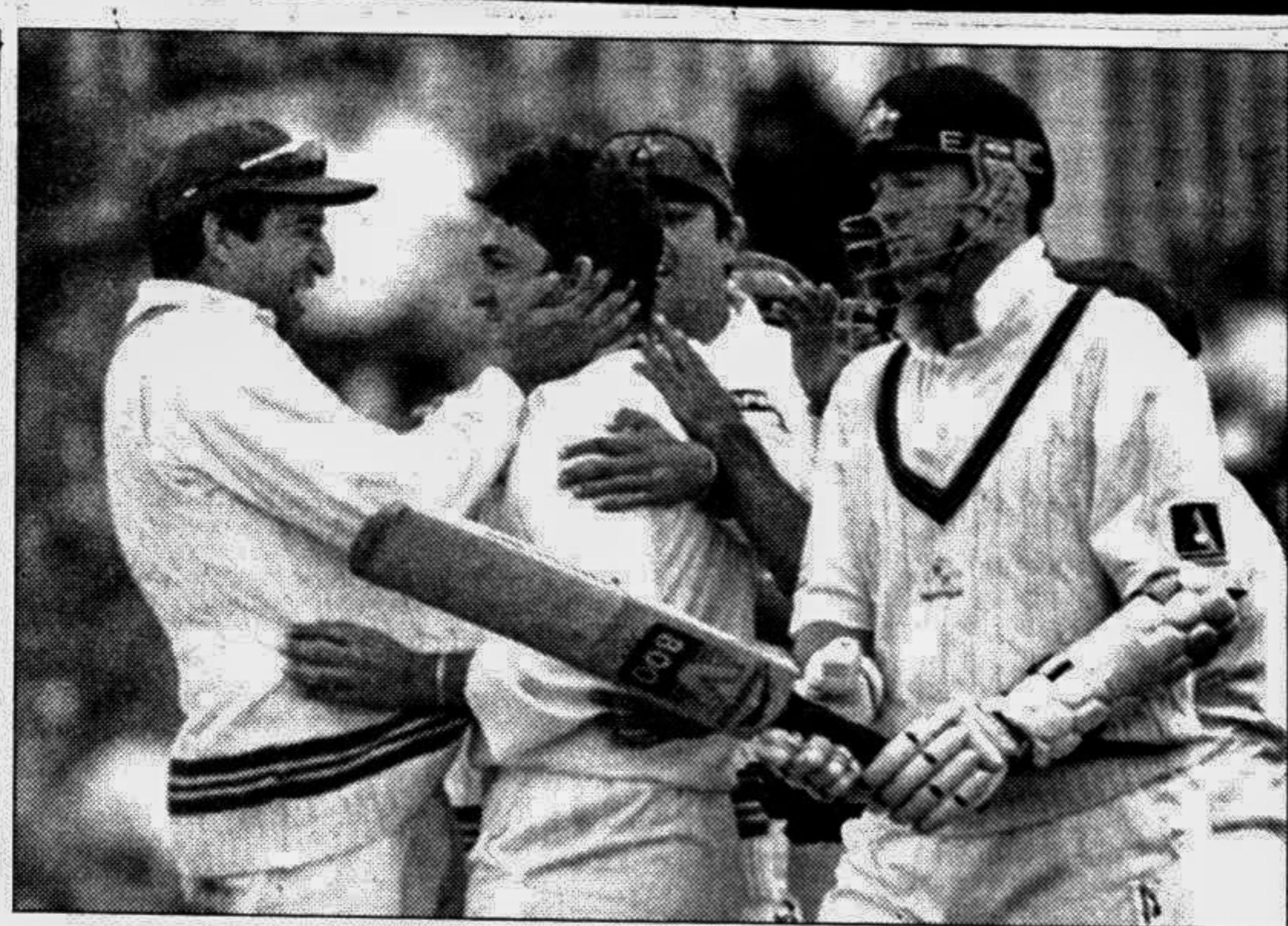
All-rounder Azhar Mahmood (C) is the toast of his teammates after dismissing Mark Waugh leg before wicket yesterday.

Langer, on four, was struck a painful blow from a misdirected full toss by tearaway Shoab Akhtar, forcing him to seek treatment before continuing.