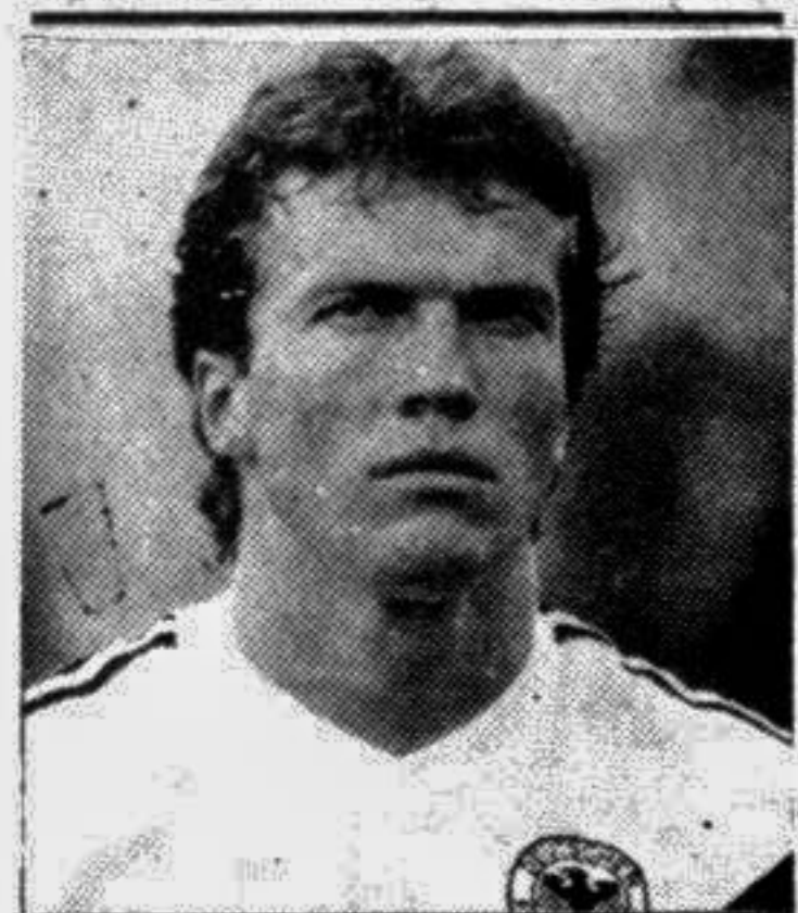
Lothar Matthaeus (German football star) "The attitude I have is that soccer is my hobby, not a job."