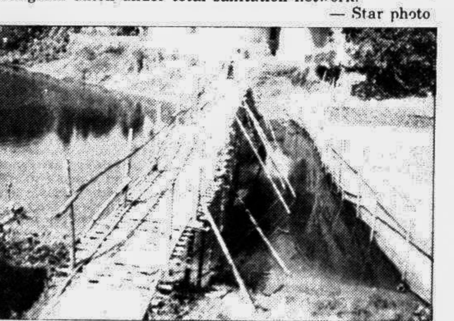
This is a bamboo bridge of Janpur Dakhinpara in Sirajganj town. The bridge should be made a pucca one immediately as it runs through Manik Mia Road, an important road of the district town.