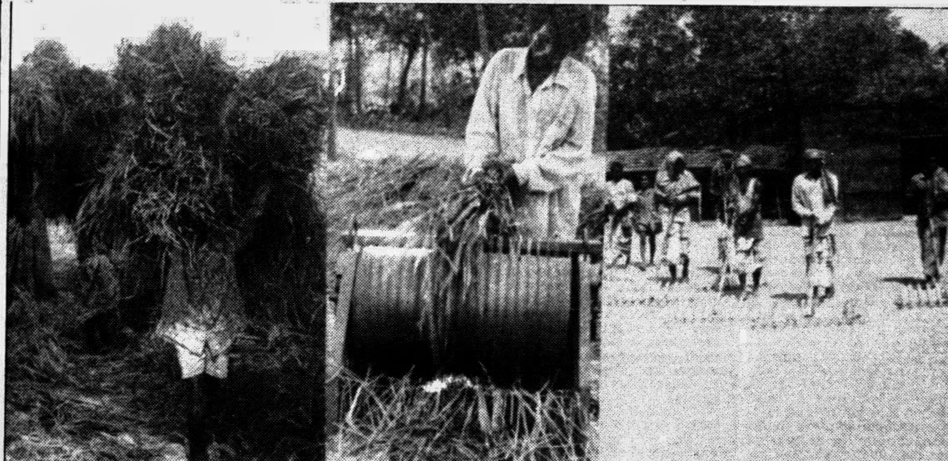
Now is the harvesting season of transplanted Aman paddy. Farmers of Magura district are also busy in harvesting paddy. Photo shows three stages from harvesting to processing in mill. (From left to right) Farmers carrying paddy home from field, thrashing paddy at home and finally labourers drying up boiled paddy at a rice mill in Magura.

RAJBARI, Nov 21: In an effort to develop the socioeconomic condition of rural poor, Bangladesh Rural Development Board (BRDB) has taken up a Tk 7.50 crore loan disbursement programme here, reports UNB. The board under its 'Employment Generation Project' has already distributed Tk 1.63 crore among its 2,900 distressed and poor members in the last four months in four thanas of the district. The thanas are Sadar, Pangsua, Goulanda and Balikandi. Board sources said the loan would be utilised in various employment generation activities like small trading, farming, pisciculture, poultry and dairy farming, cottage industries and rural transportation.