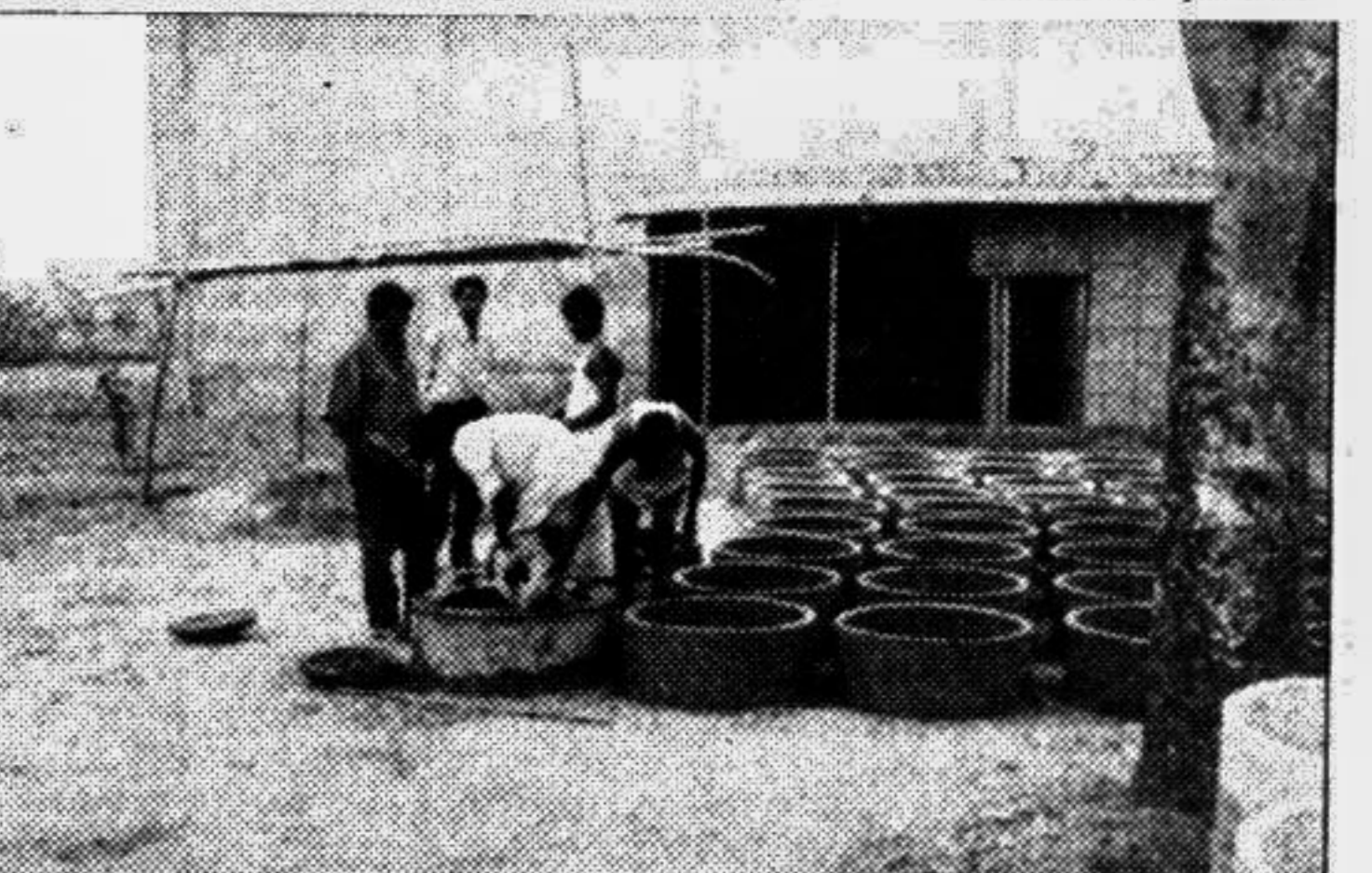
UNICEF and Patgram thana administration have jointly taken up a programme to distribute rings of sanitary latrines among the inhabitants of Dahagram enclave under Patgram thana in greater Rangpur district free of cost. The programme has been taken up to bring the entire Dahagram union under total sanitation network.