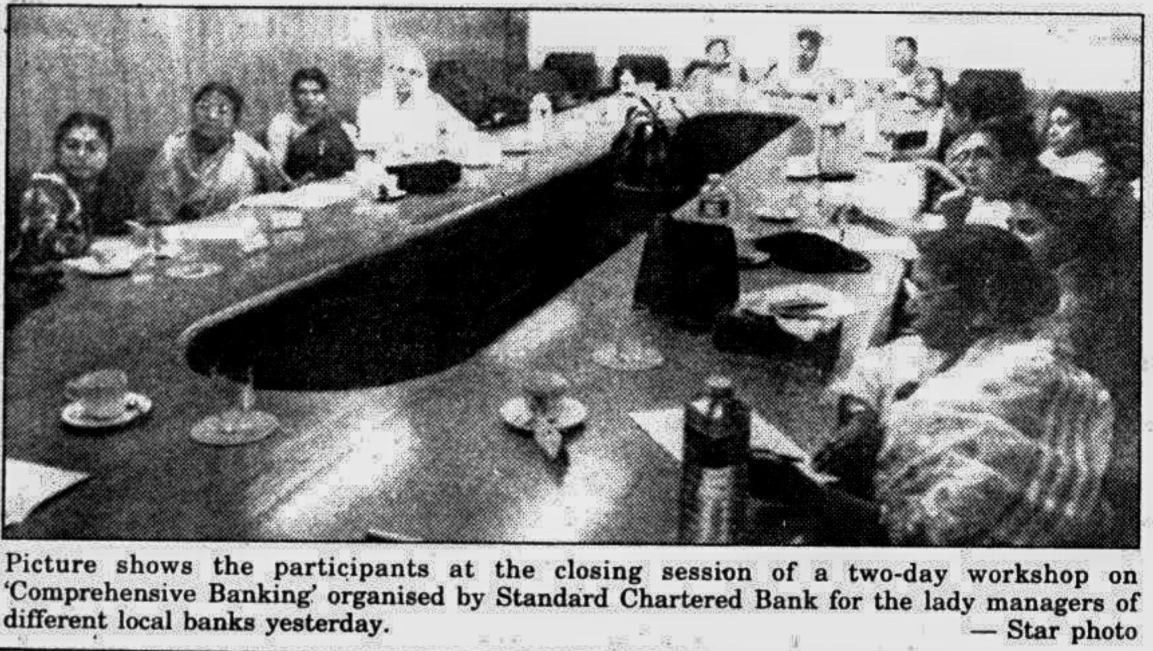
Picture shows the participants at the closing session of a two-day workshop on 'Comprehensive Banking' organised by Standard Chartered Bank for the lady managers of different local banks yesterday.