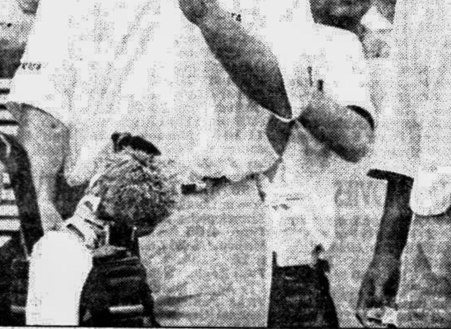
Americans Mark O'Meara (L) and Tiger Woods talk during the second round of the Golf World Cup in Kuala Lumpur yesterday.

Sunday, at Christchurch, Australia-Qatar, at Dunedin, Paraguay-Brazil.