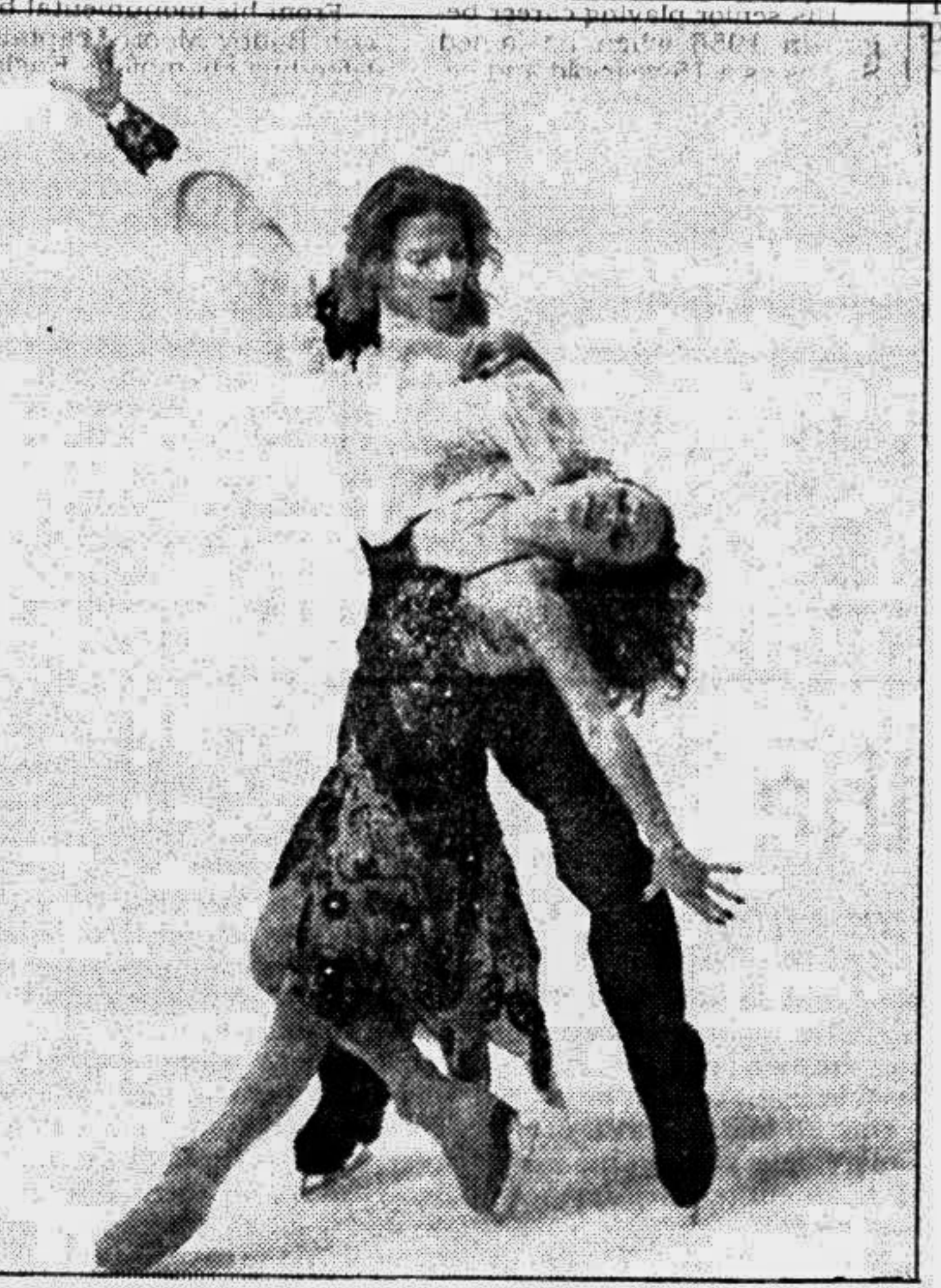
French pair of Marina Anissina and Gwendal Peizerat performing in the dance programme of the Lalique Trophy figure skating competition in Paris on November 18.

Option 3 Pot A: Belgium, Netherlands, Germany, Spain Pot B: Romania, Norway, Sweden, Czech Republic Pot C: Yugoslavia, Portugal, France, Italy Pot D: England, Turkey, Denmark, Slovenia.