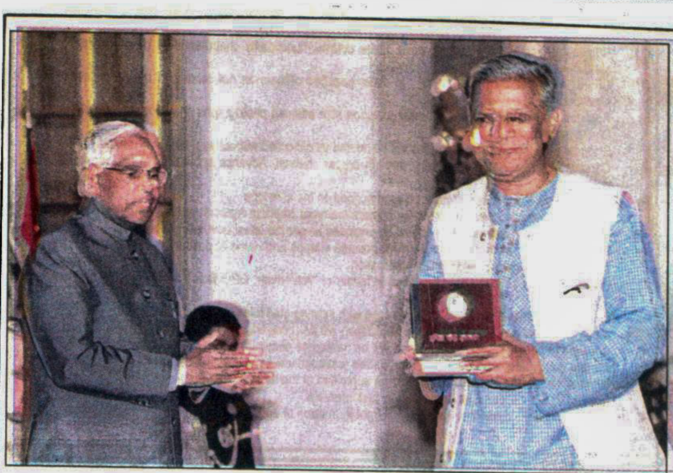
Prof Muhammad Yunus (R) receiving the 1998 Indira Gandhi National Award for Peace from Indian President K R Narayanan at the Presidential Palace in New Delhi yesterday.