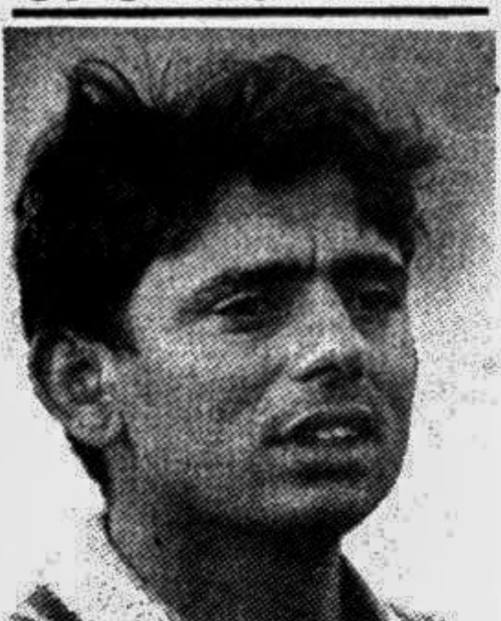
Saqlain Mushtaq (Pakistani off-spinner) "Everybody teases me but I always tell everybody I will make 100." On his ambition to score a Test century.