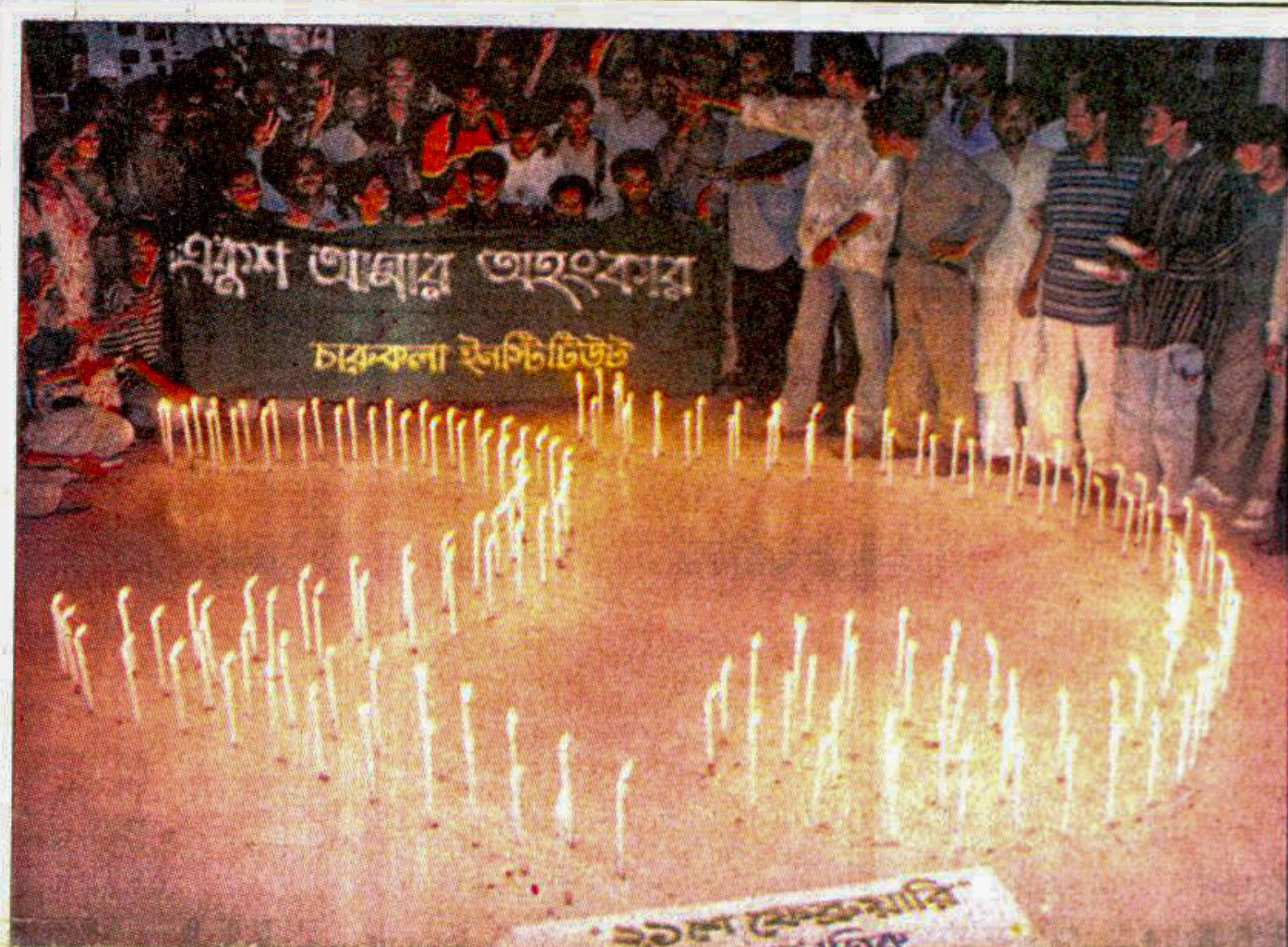
Students of Fine Arts Institute celebrating UNESCO's declaration of February 21 as International Mother Language Day by forming Ekush (21) with candles last night.