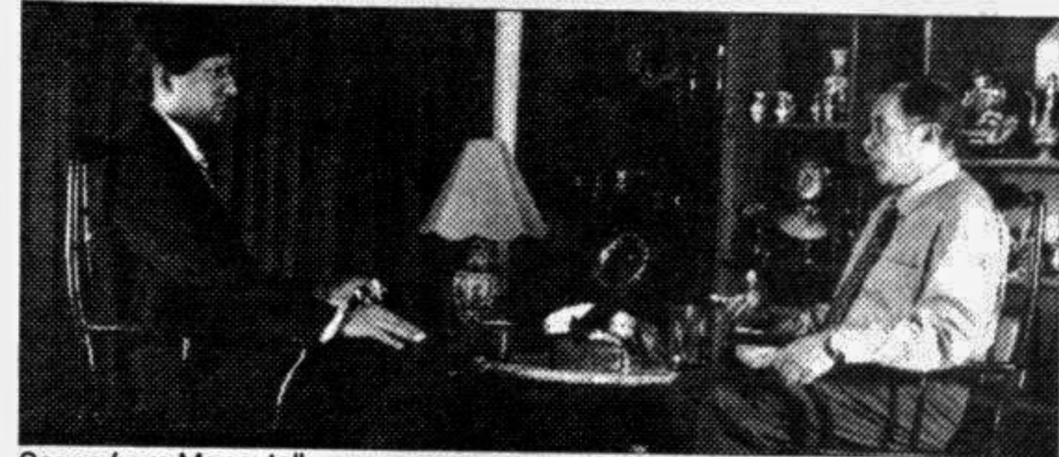
Scene from Moneytalk

Lt Gen (Retd) Noor Uddin Khan, Minister for Science and