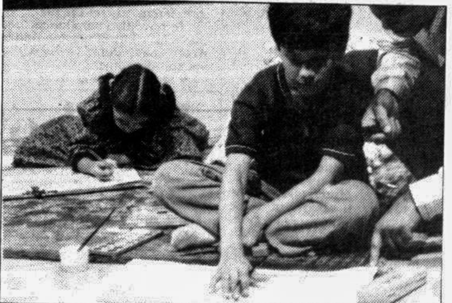
Scene from Children's Magazine Kathakali