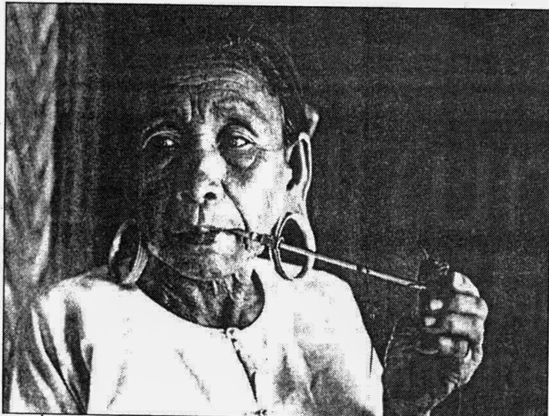
photograph shows a Murong village on a hill top — amidst breath taking beautiful scenery. The photographs also show young girls weaving brightly coloured Pinions (a traditional

There are also photographs of 'Machang Ghars' (Hots on stilts, the 'ground floor' used for keeping domestic animals) with peculiar ladders to climb up. Some photographs show babies being lulled to sleep in cute bamboo cradles. One particular