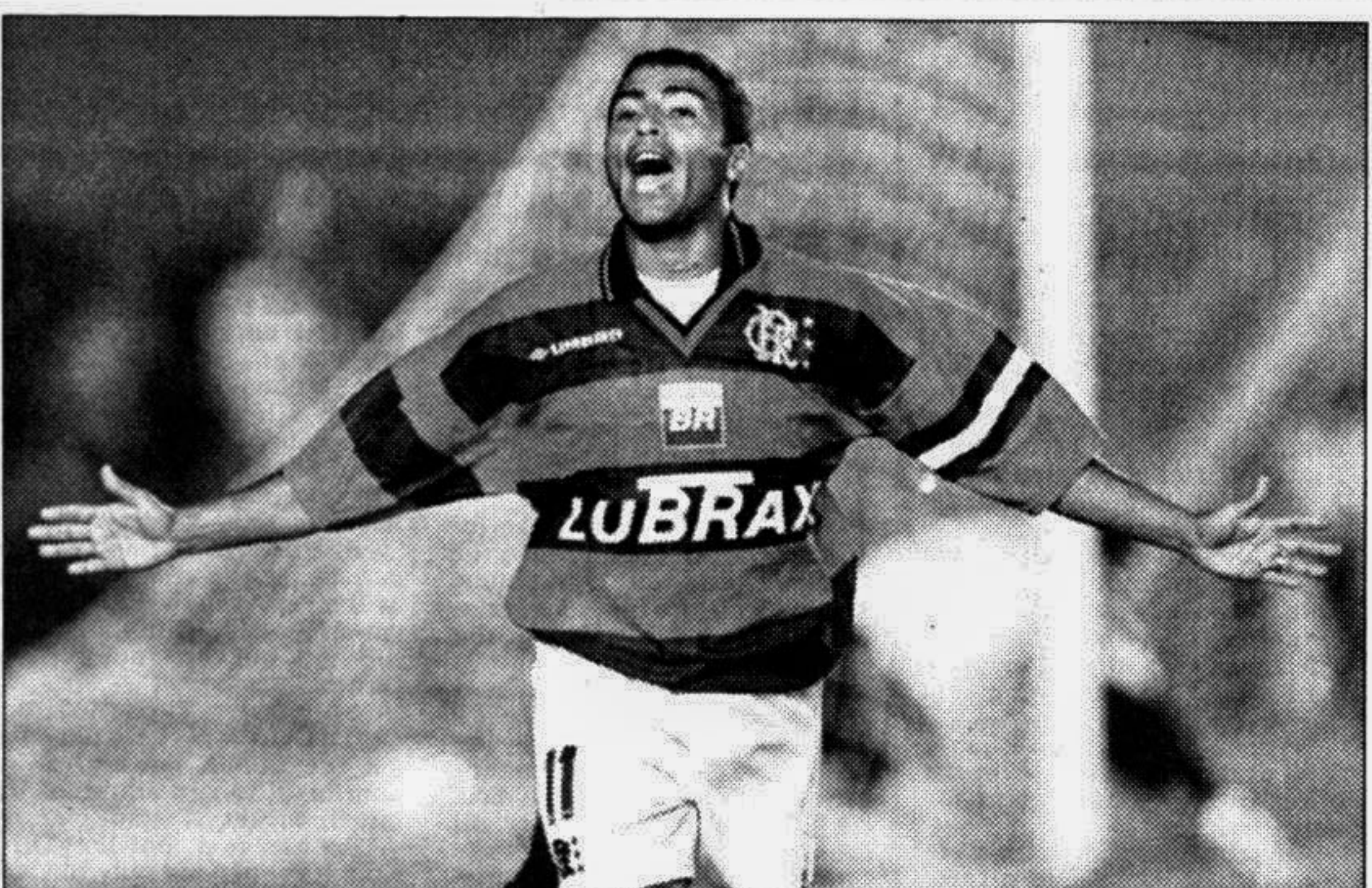
An AFP file photo of Brazilian football superstar Romario who has signed a three-month deal with Saudi club Al-Nassr to appear in the World Club Championship in January 2000.