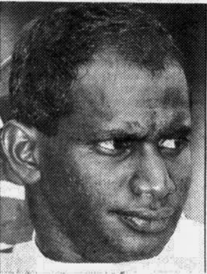
SANATH JAYASURIYA scored his first Test cricket, will be strong. It might also encourage the present team to believe that their recent humiliating defeats by Australia and then by South Africa in two