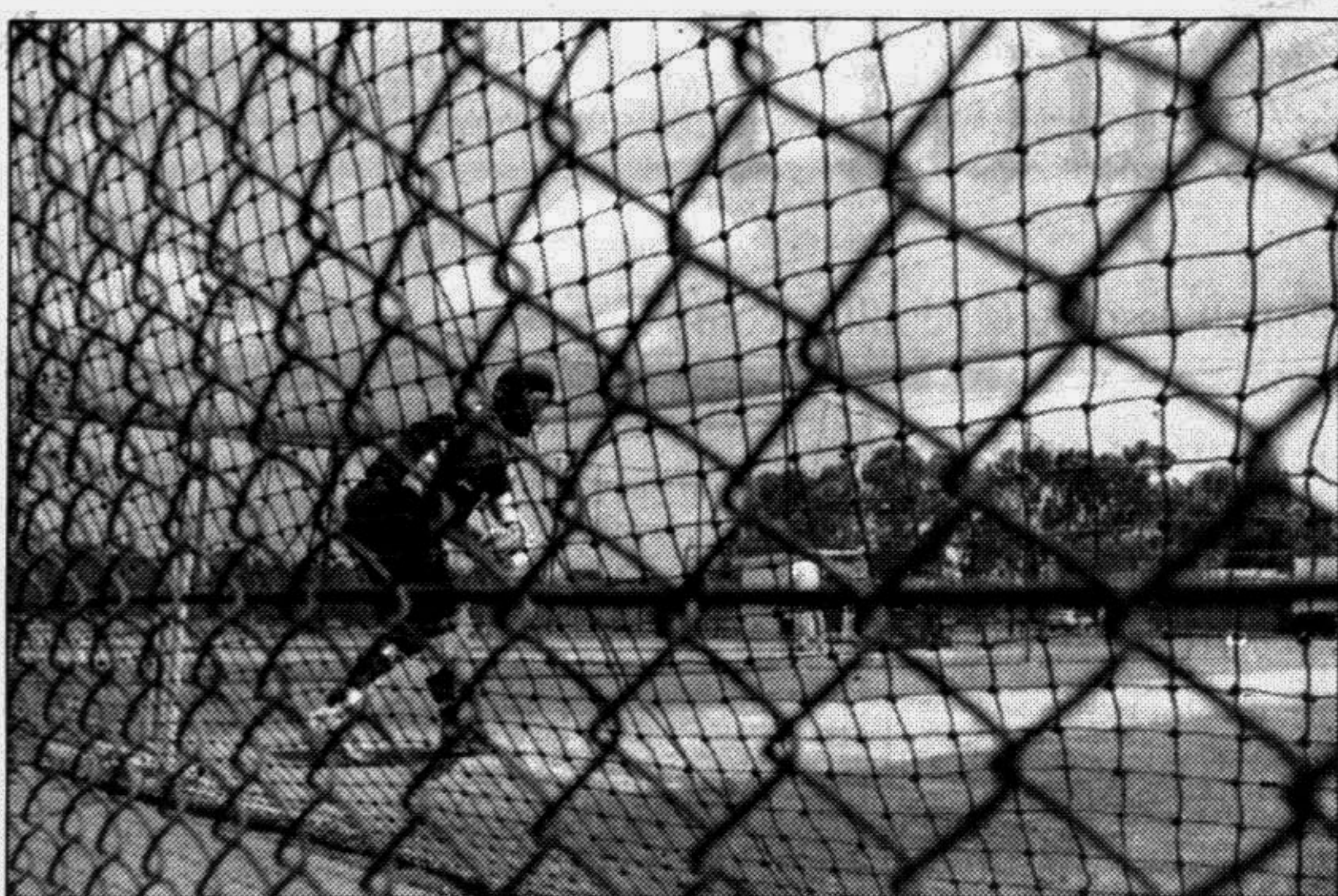
Former England captain Alec Stewart batting in the nets during a practice session at Centurion Park yesterday.

"I told him I believe he's the best number three in Australia and that's why he's in the team. He's trying his hardest and I'm sure he's ready for a big score."