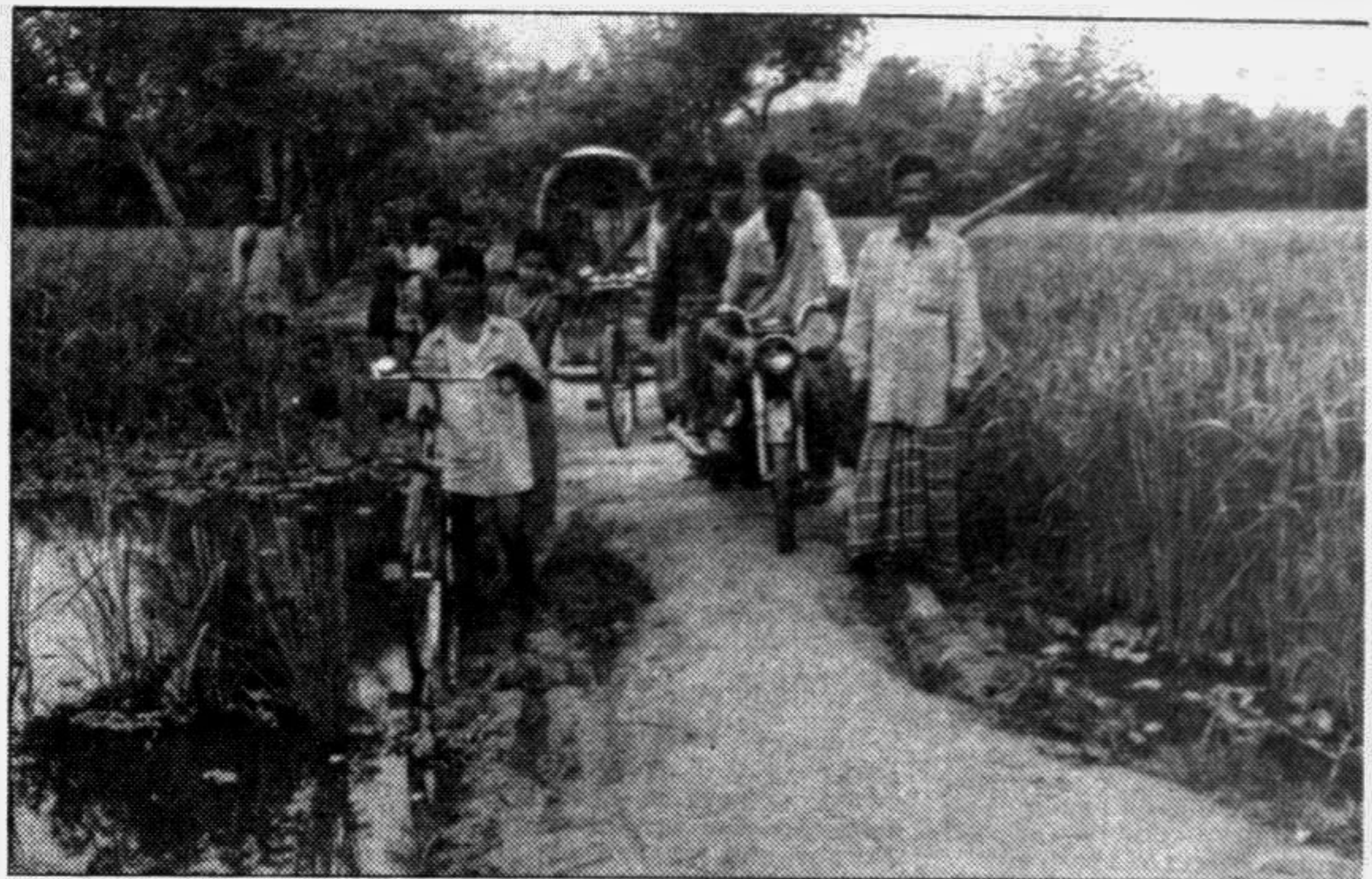
Hazipur-Nandina Bazaar Road is an important road of Kendua union in the Sadar thana of Jamalpur district. The road which runs through Mollah Para was damaged by flood in 1988, but it is yet to be reconstructed. Pedestrians and vehicle drivers suffer a lot due to very bad shape of the road. The picture was taken recently by our correspondent recently.

According to Agricultural Extension Division (AED) sources, the sugarcane was cultivated on about 14,932 hectares in 10 districts of the division during the season as against the target of 14,150 hectares. Sugarcane was cultivated on 729 hectares in Jessore, 1,570 hectares in Jhenidah, 300 hectares in Magura, 950 in Narail, 1,050 hectares in Khulna, 1,071 hectares in Bagerhat, 2,555 hectares in Satkhira, 2,850 hectares in Kushtia, 3,144 hectares in Chuadanga and 363 hectares in Meherpur district. The sugarcane which is produced in non-mill zone areas is generally used for the preparation of sugar and molasses locally.