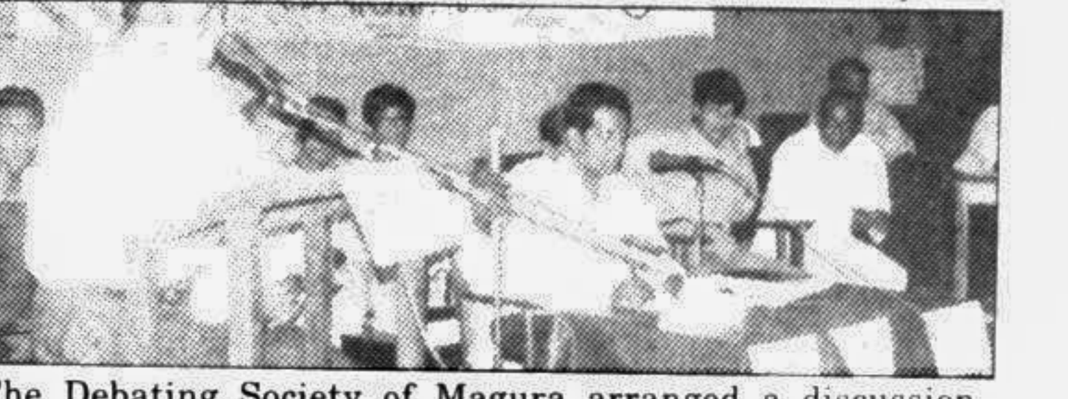
The Debating Society of Magura arranged a discussion meeting recently at Magura Asaduzzaman Auditorium in observance of the society's founding anniversary.