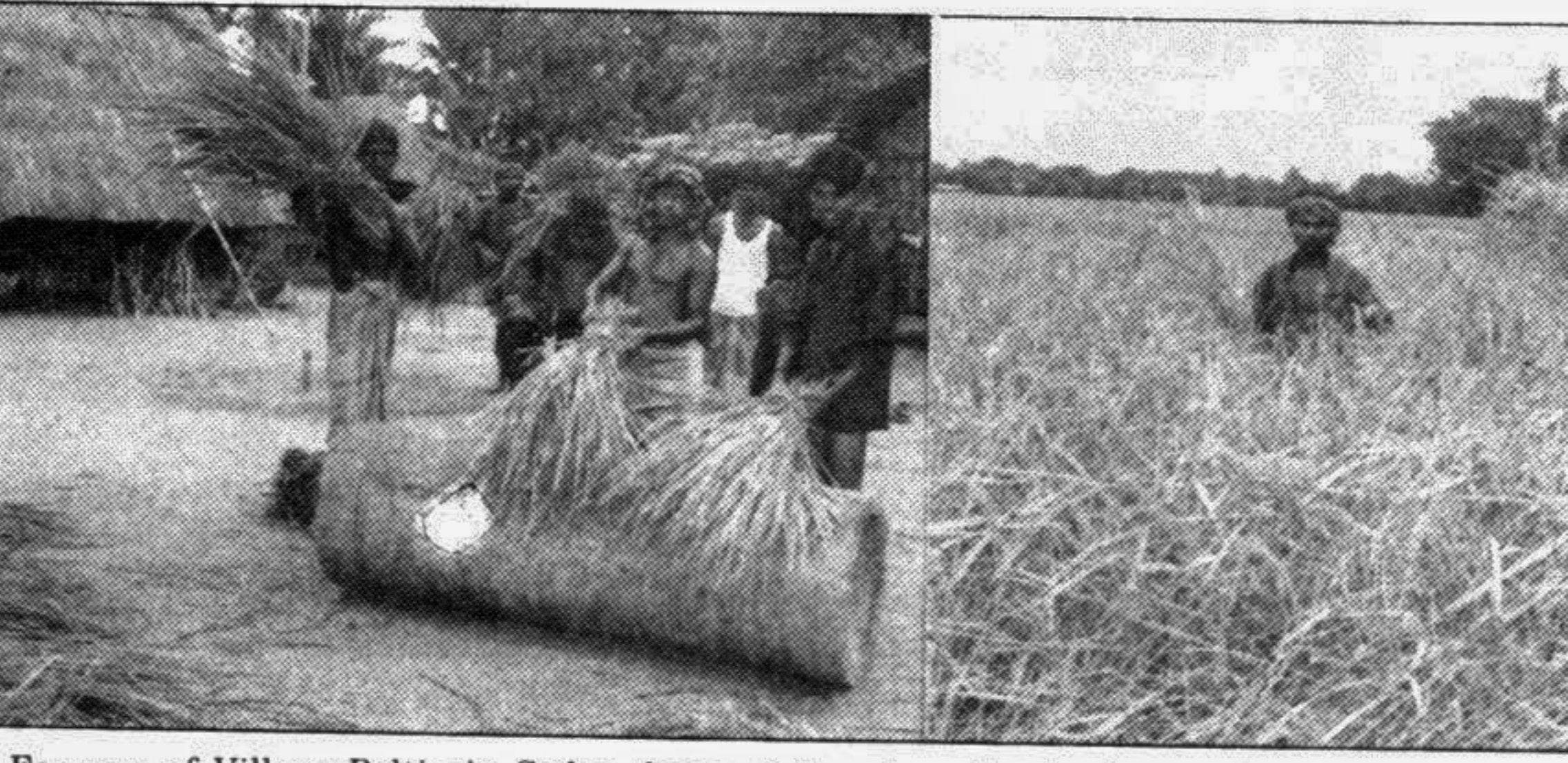
Farmers of Village Beltia in Sadar thana of Jamalpur district have achieved bumper production of high yielding variety 'Nazirshail' Aman paddy this year. Photo shows happy farmers are engaged in harvesting.