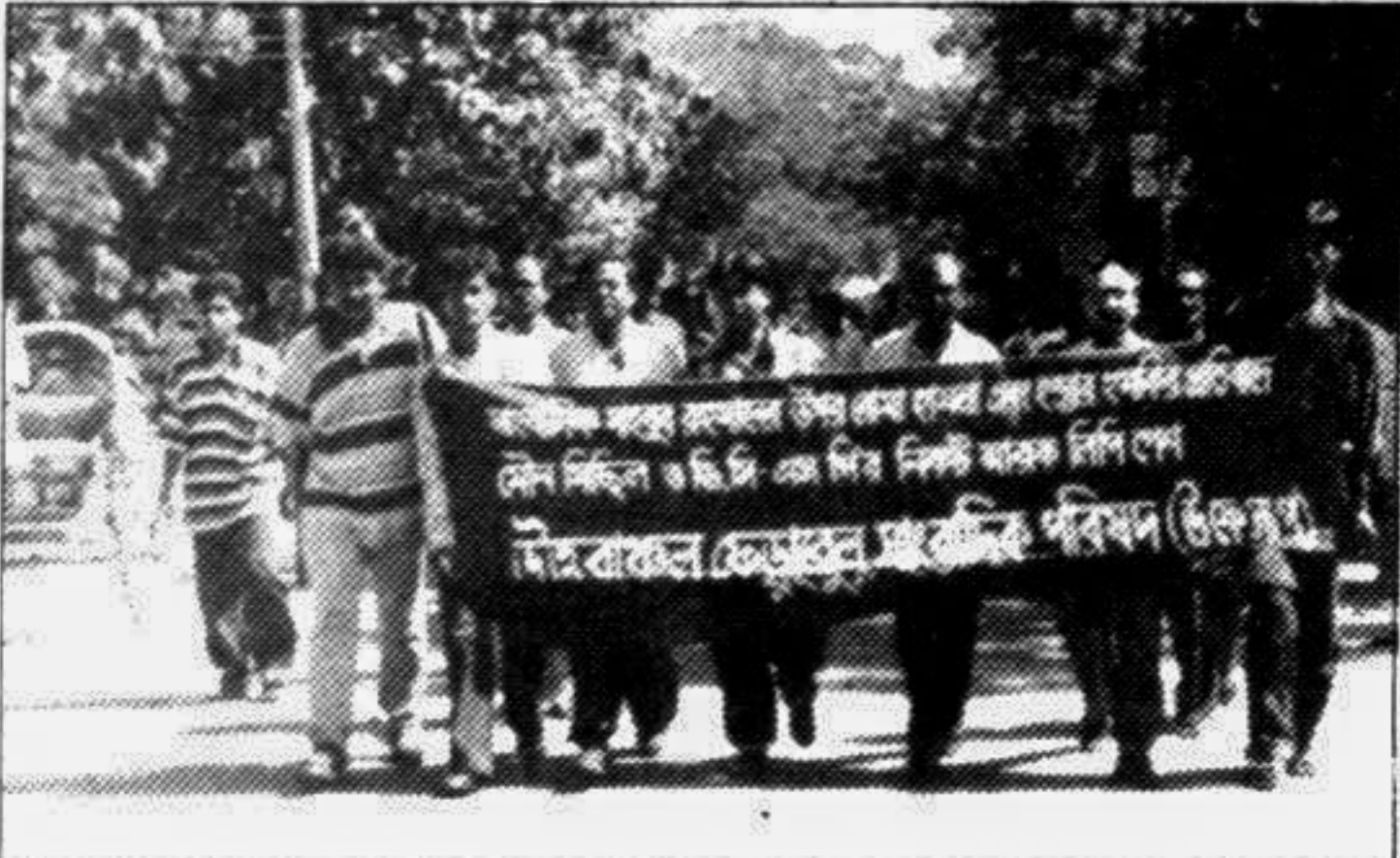
Attack on press: The local journalists in Rangpur brought out a procession in the town demanding immediate arrest and punishment to the attackers who assaulted recently the Rangpur correspondent of The Daily Star photo