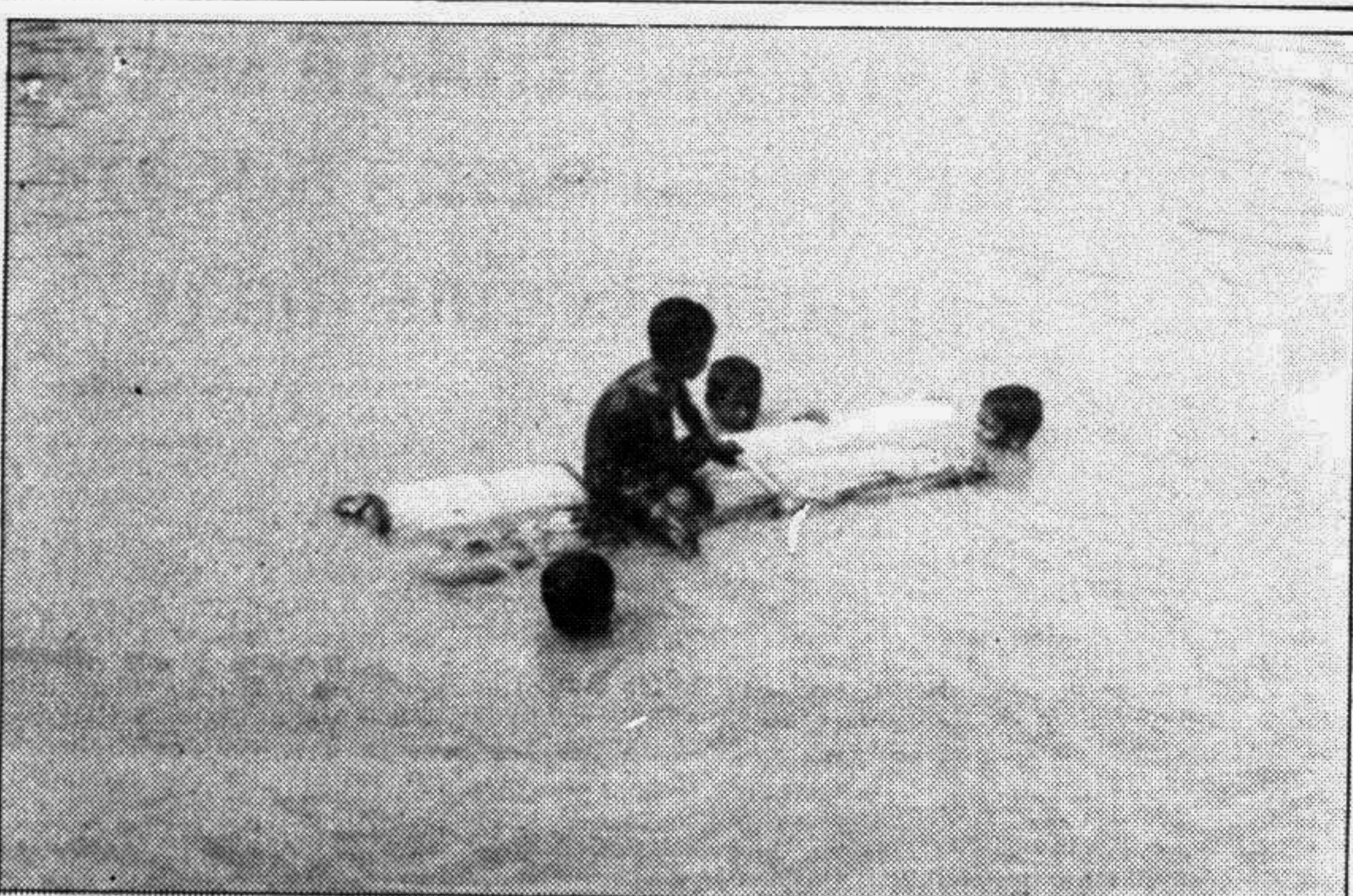
Joy of childhood days: This is an irrigation canal at village Jalsuka in Saikupa thana of Jhenidah district. Some innocent rural children playing in the canal with a raft unaware of any danger.