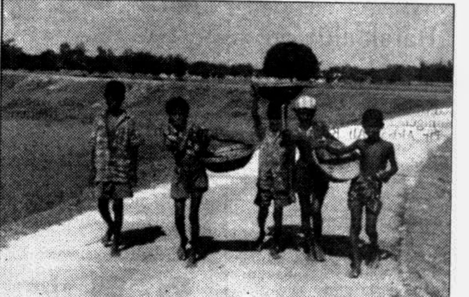
Many faces of child labour: Five children of village Nayabad in Kaharol thana of Dinajpur district have set out for collecting cowdung in the Kantajir Temple area. Cowdung is still used in the northern districts as fuel and other domestic purpose.