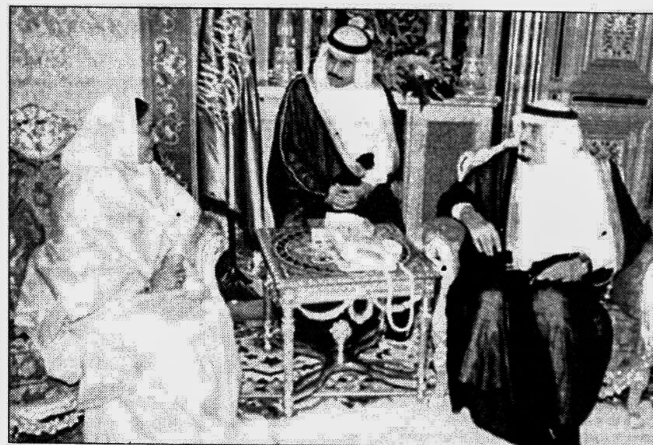
Prime Minister Sheikh Hasina meets Saudi King Fahd at the Royal Palace in Riyadh on Tuesday.