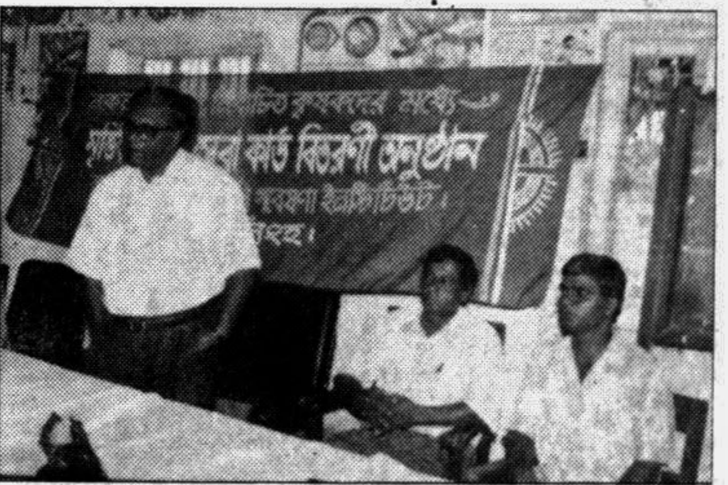
Speakers addressing recently at the Soil Health Nursing Cards distribution ceremony in Mymensingh.