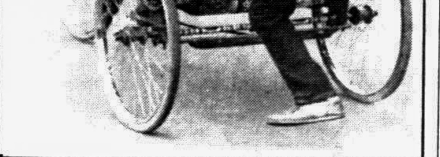
A picket trying to damage a rickshaw on a city road during yesterday's hartal.