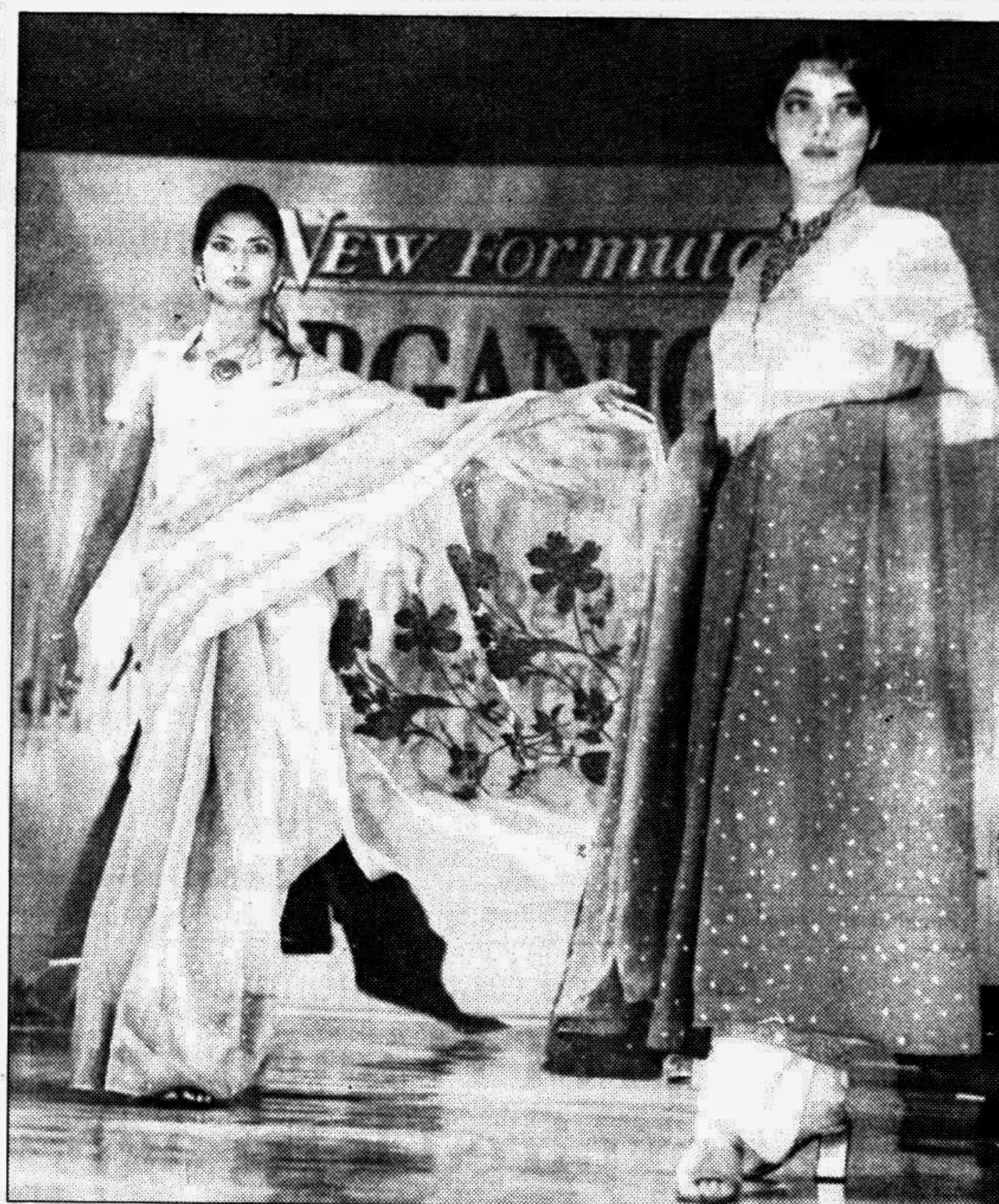
Two models at a fashion show at Sheraton Hotel in the city yesterday.

Published by the Editor from City Publishing House, 4, 90 Kakrail, Dhaka-1000 on behalf of Mediaworld Ltd., 52 Motijheel C.A., Dhaka-1000. Editorial, News & Commercial Offices: House No: 11, Road No: 3, Dhanmondi R/A, Dhaka-1205. PABX: 8616772-4, Commercial: 8616771, Fax No: 88-02-8613035, GPO Box No: 3257, Cable: DAILYSTAR, DHAKA. Internet edition address: http://www.dailystarnews.com and Email address: dstar@bangla.net