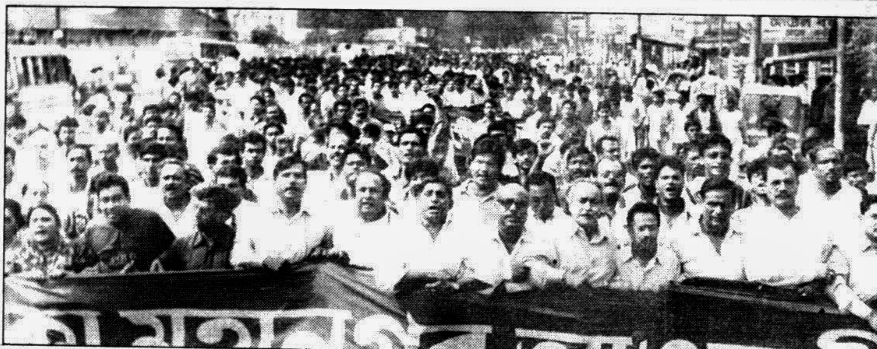
Anti-hartal procession by ruling Bangladesh Awami League in front of Secretariat building during dawn-to-dusk hartal yesterday.