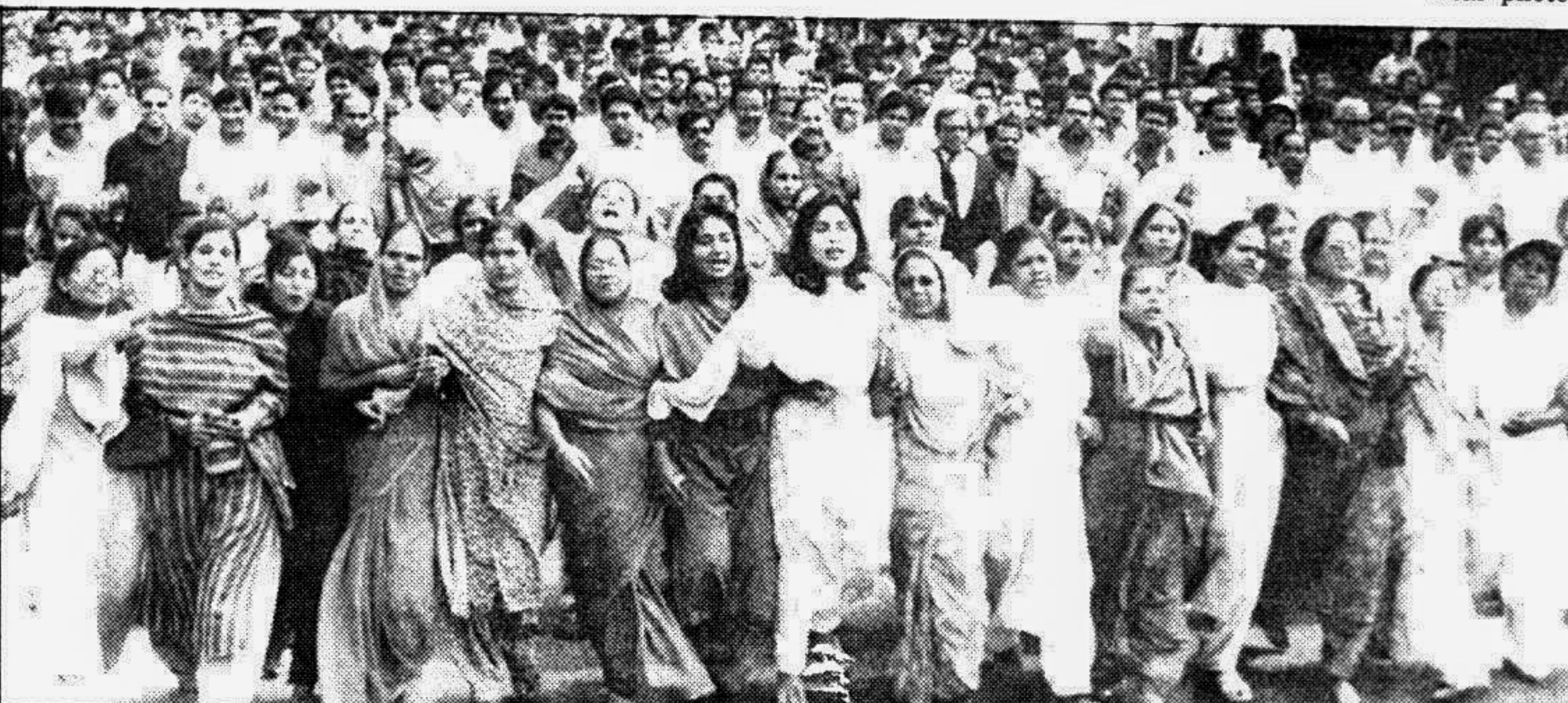
Bangladesh Nationalist Party (BNP) staged a protest rally in the city during hartal hours yesterday.