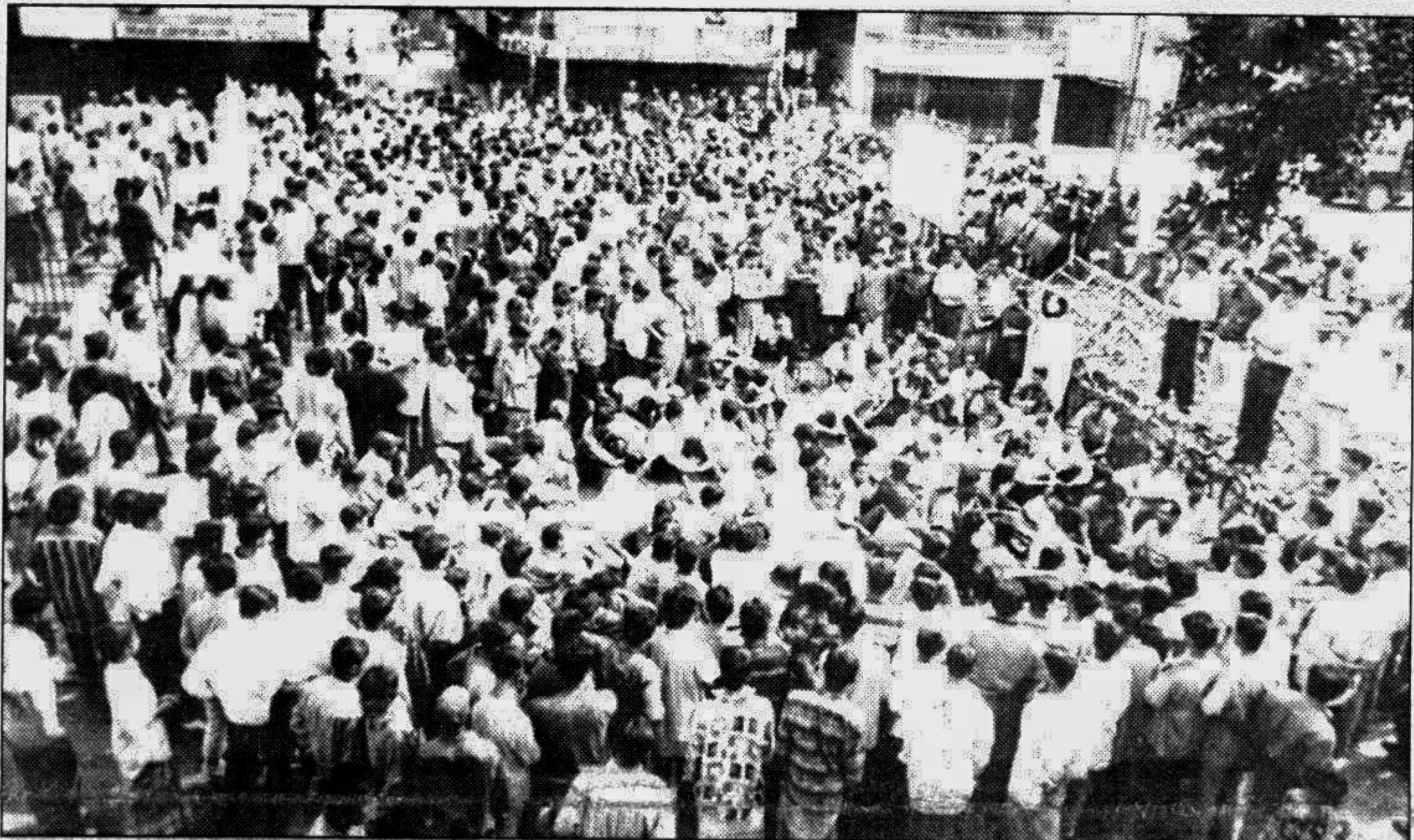
Police intercepted a joint procession of BNP, Jatiya party and Jamaat-e-Islami at Bijoy Nagar as it was proceeding towards Purana Paltan area in the city during yesterday's hartal.