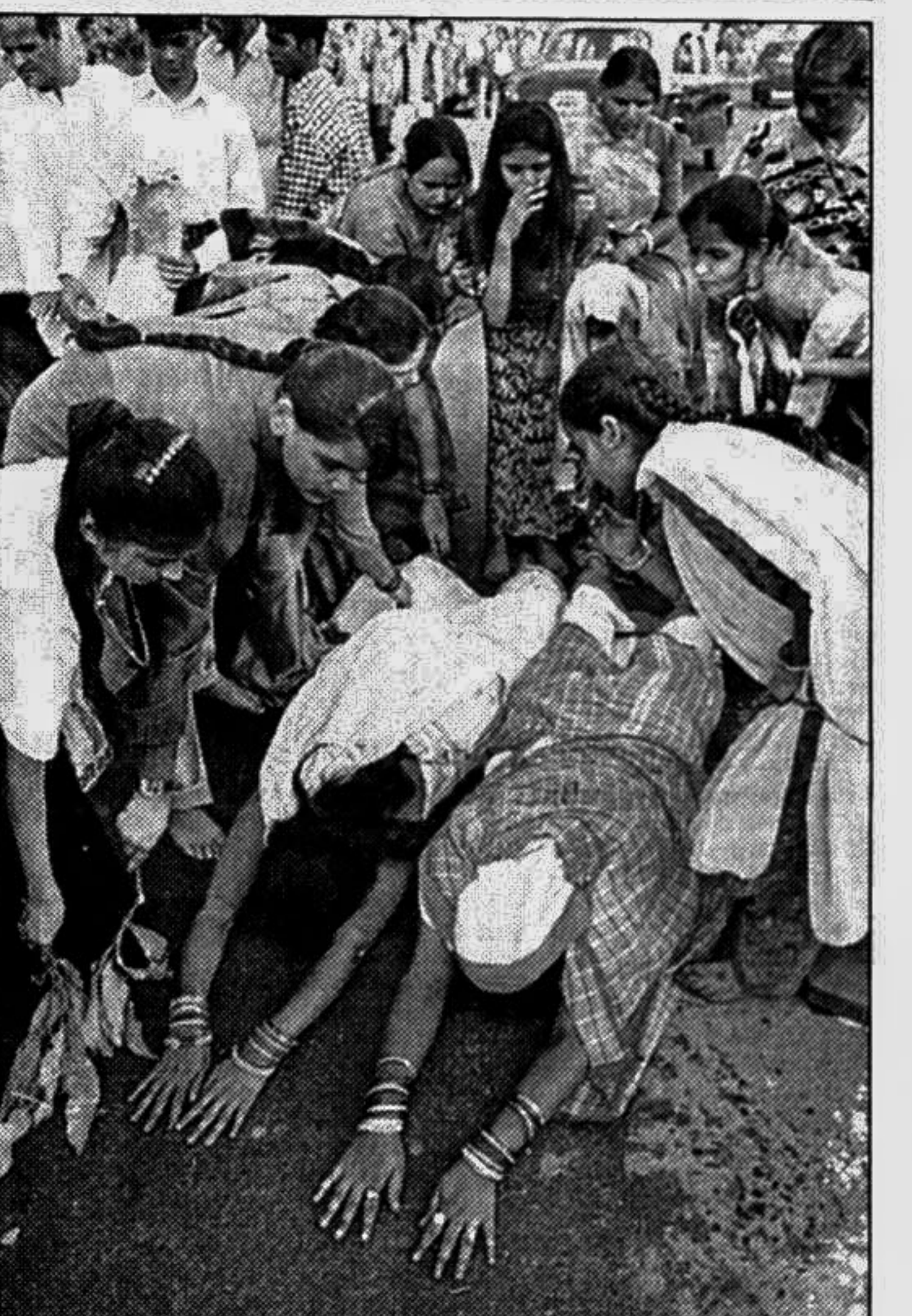
Two women devotees lie on the street as they pray to the sun god as their family members receive the women's blessing during "chhat puja", a popular Hindu religious festival in North India yesterday. Chhat puja involves the worship of sun, when thousands of devotees take a holy dip in the River Ganges as they pray to the setting Sun.