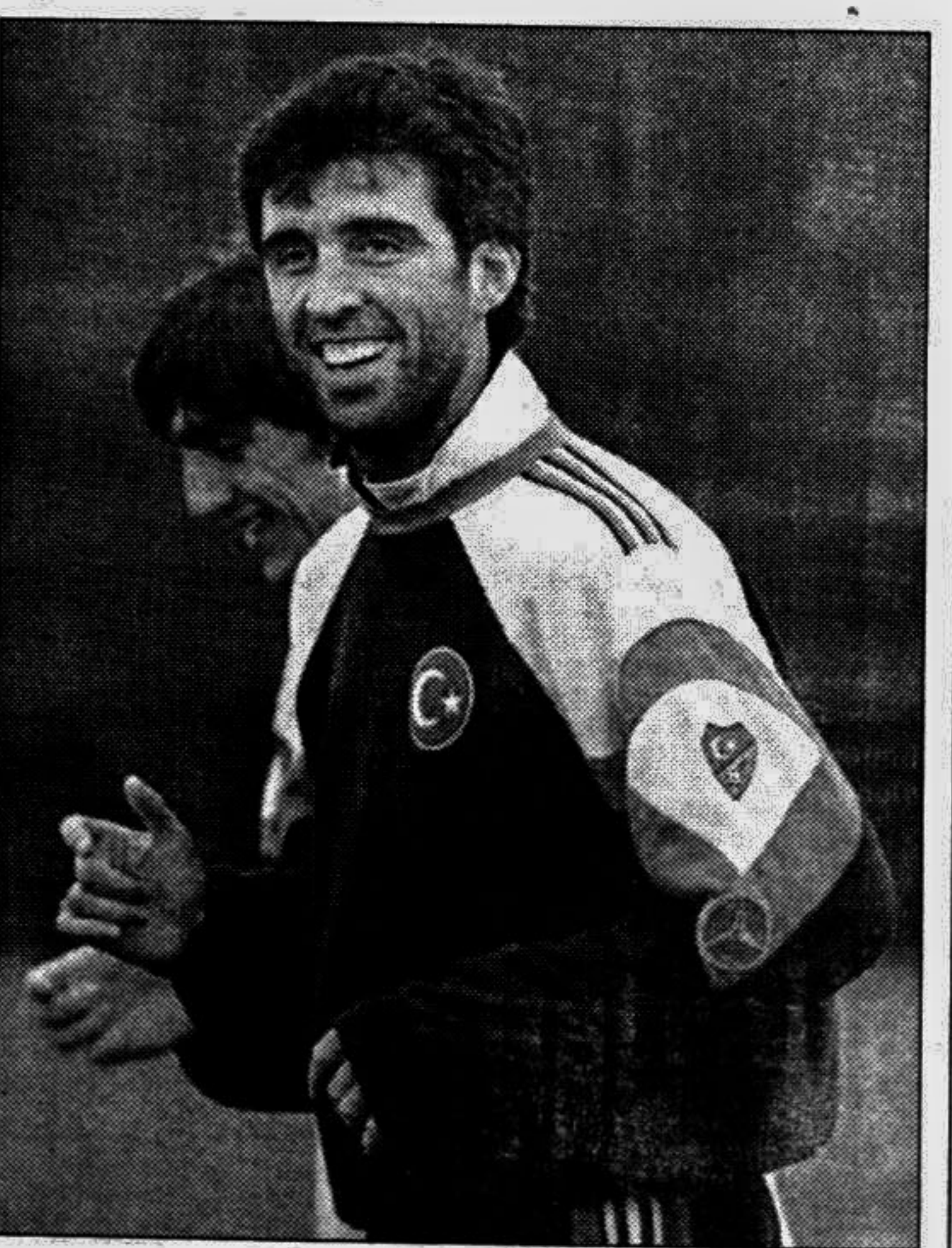
Turkey striker Hakan Sukur smiles during a training session in Dublin on November 11.

Ireland: Alan Kelly; Stephen Carr, Gary Breen, Kenny Cunningham, Denis Irwin; Rory Delap, Roy Keane, Lee Carsley, Kevin Kilbane; Niall Quinn, Robbie Keane. Turkey: Rustu Recber; Ogun Temizkanoglu, Fatih Akyel, Alpay Ozalan, Ali Eren Beserler; Tugay Kerimoglu, Tayfun Korkut, Abdullah Ercan, Serkan Yalcin, Arif Erdem; Hakan Sukur. Referee: Anders Frisk (Sweden).