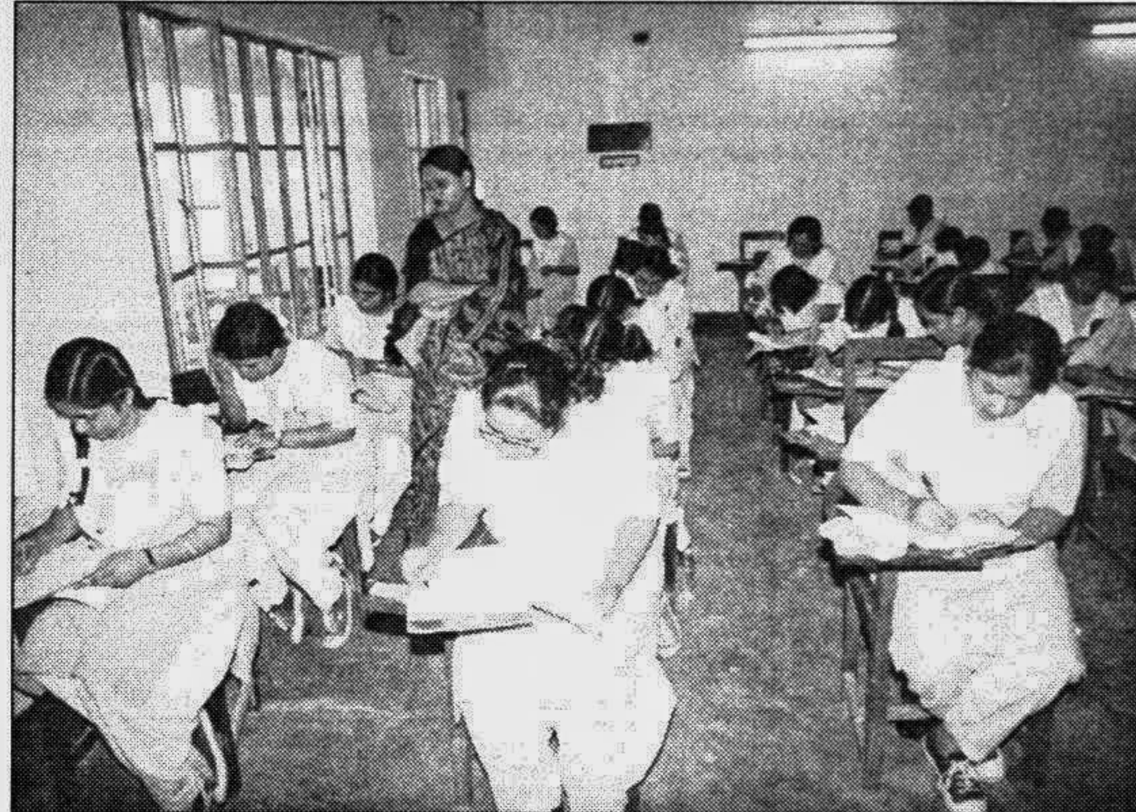
Scheduled examinations of various schools in the city which could not be held on November 9, owing to opposition organised Hartal (general strike) were conducted on Friday under special arrangements. Photo shows examinations in progress at the Vignarunessa Noon School.

Some of the boatmen are reported to be residents in slums at Kamrangir char, Kamalbagh and Keraniganj areas. With the small income they make after meeting the demands of ghatdars and their mastans, they are said to be eking out a miserable existence. The boatmen are said to pass their life without any protest or co-ordinated action for relief from any quarter against the oppression of the ghatdars and their mastans.