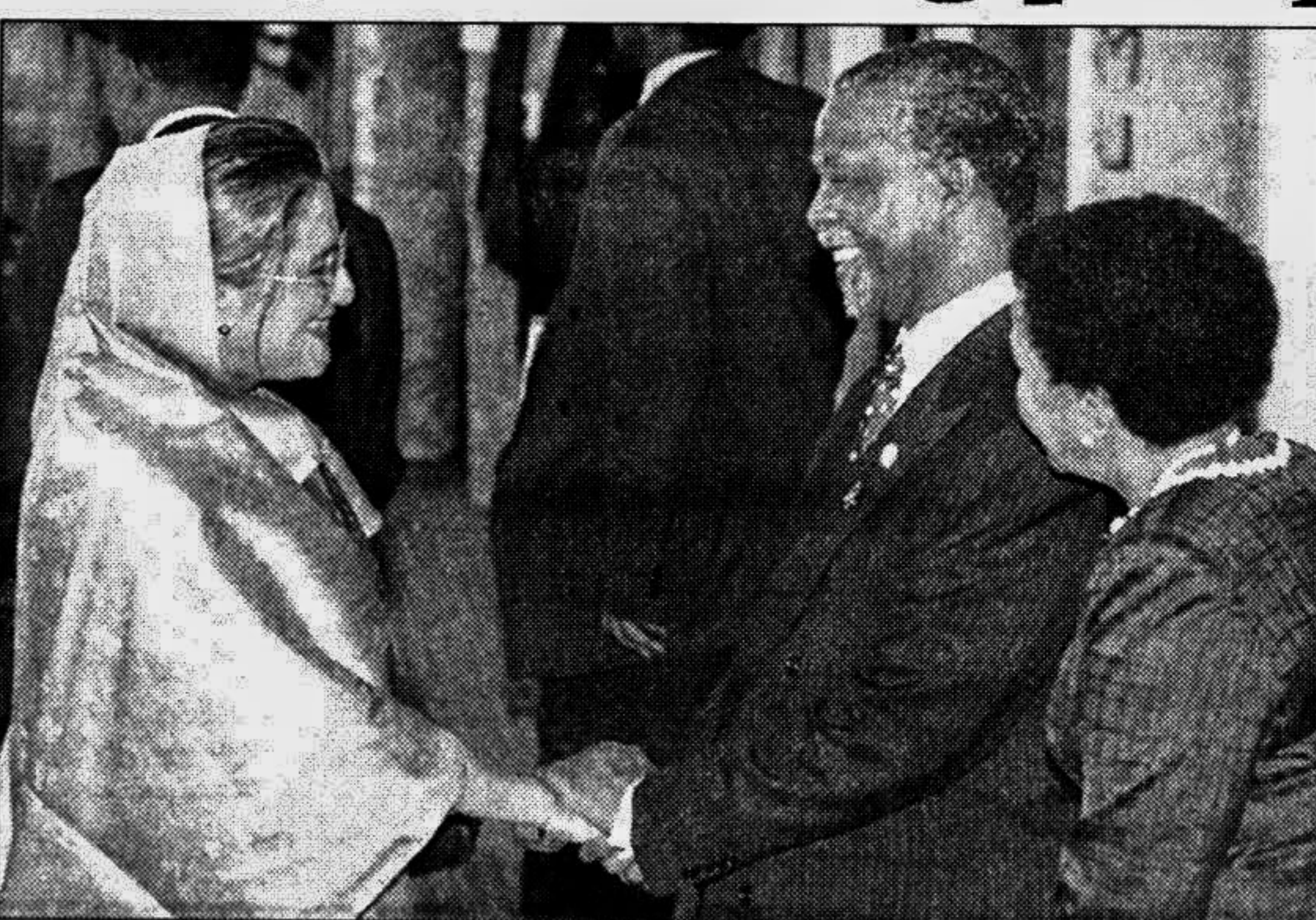
Prime Minister Sheikh Hasina is greeted by South African President Thabo Mbeki (C) and his wife Zanele (R) upon her arrival at the International Conference Centre in Durban yesterday for the Commonwealth summit.