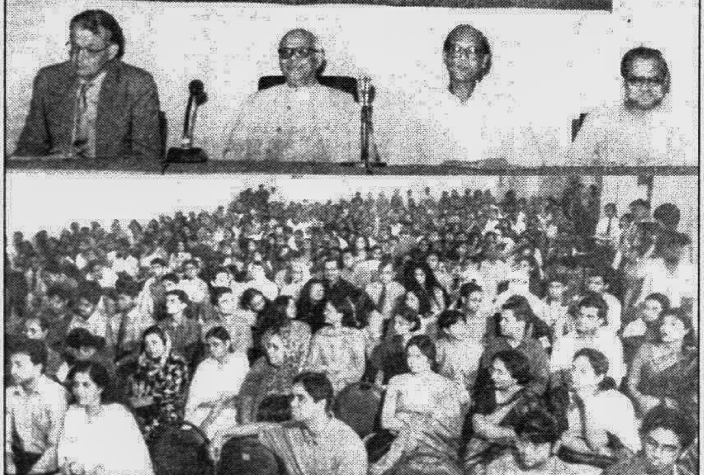
The speakers and participants at the award giving ceremony yesterday.