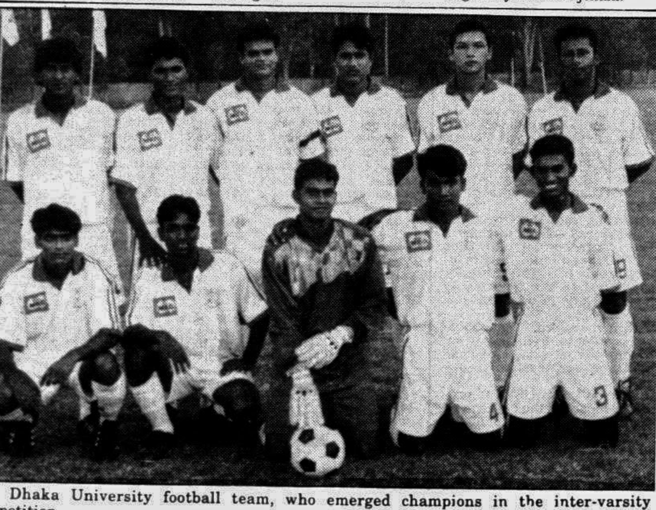
The Dhaka University football team, who emerged champions in the inter-varsity competition.

Gala quoted a friend of Graf's saying that they were buying presents for Agassi's coach Brad Gilbert, whose wife is pregnant.