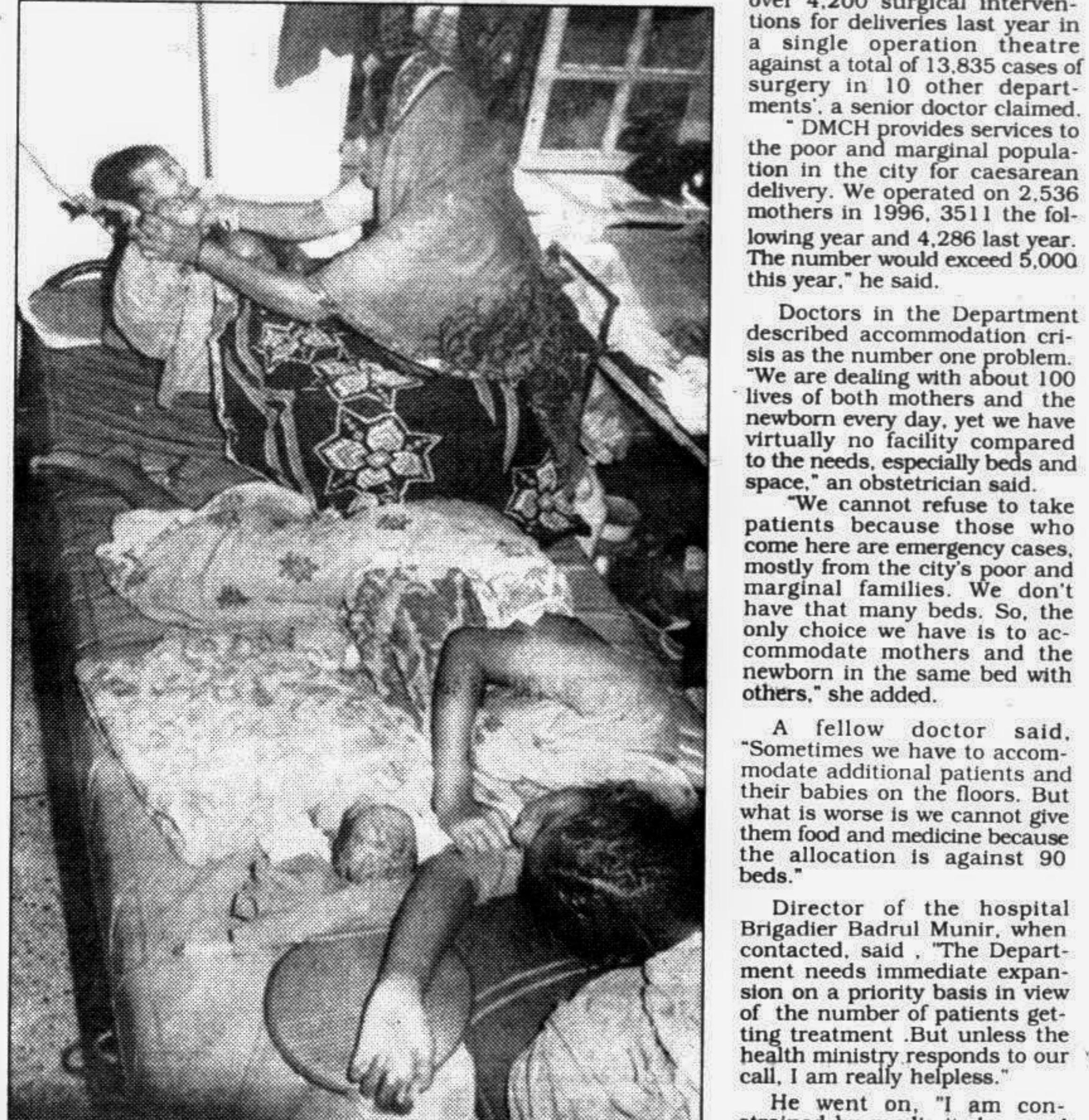
Two mothers sharing a single bed in Ward-15 of DMCH. There is no cot for their babies.

Influx of expectant mothers for caesarian surgical delivery at Dhaka Medical College Hospital is increasing every day, but the hospital is unable to cope with the situation. Of the 24,744 patients admitted to DMCH last year, 11,206 were in Obstetric Department alone. Most of them had to share beds with two or more mothers or stay on the floors. The Department has 90 beds only for mothers, but no baby cots for the newborn. Operations are conducted at the hospital virtually without any emergency equipment to handle crisis, a spot visit and interviews with doctors concerned revealed. The most important section