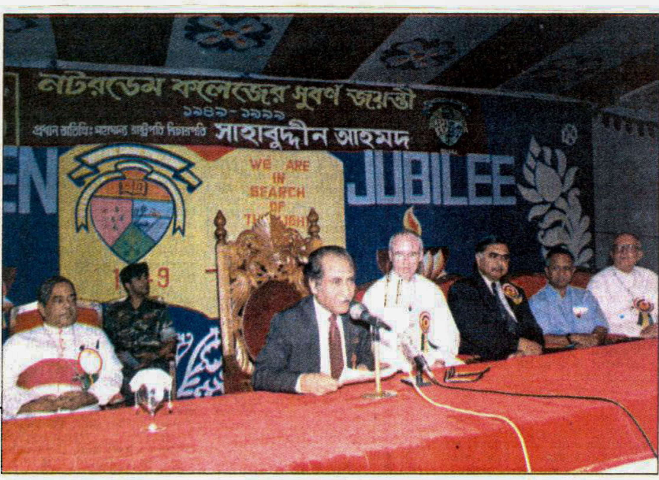
President Shahabuddin Ahmed addressing the function celebrating Golden Jubilee of Notre Dame College in the city yesterday.

Published by the Editor from City Publishing House Ltd., 90 Kakrail, Dhaka-1000 on behalf of Mediaworld Ltd., 52 Motijheel C.A., Dhaka-1000. Editorial, News & Commercial Offices: House No: 11, Road No: 3, Dhanmandi R/A, Dhaka-1205. PABX: 8616772-4, Commercial: 8616771, Fax No: 88-02-8613035, GPO Box No: 3257, Cable: DAILYSTAR, DHAKA. Internet edition address: http://www.dailystarnews.com and Email address: dstar@bangla.net