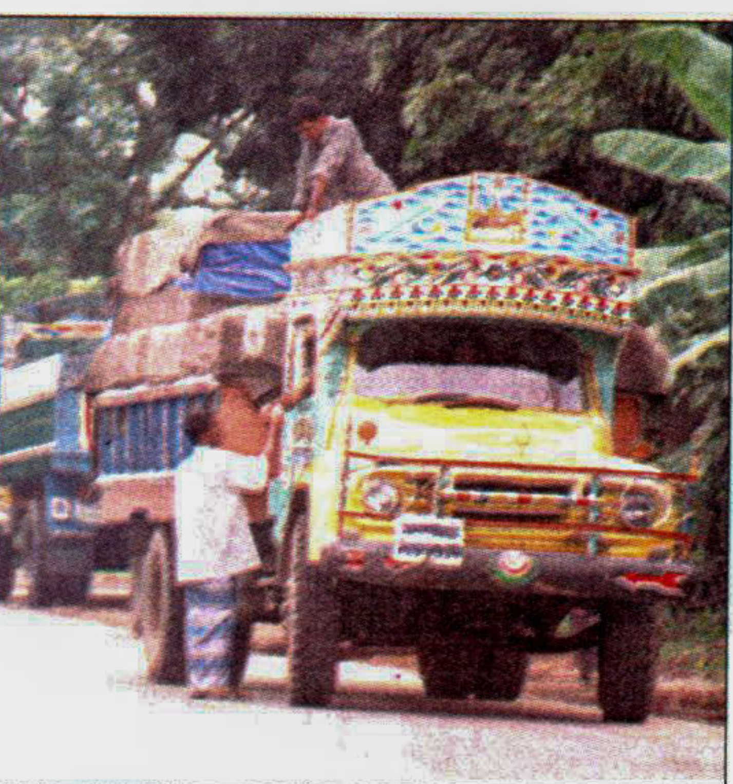
The man in lungi collecting 'beat' money at Chomile under Fultala thana for the policemen waiting on their motorbikes (not in picture) on the other side of the road.