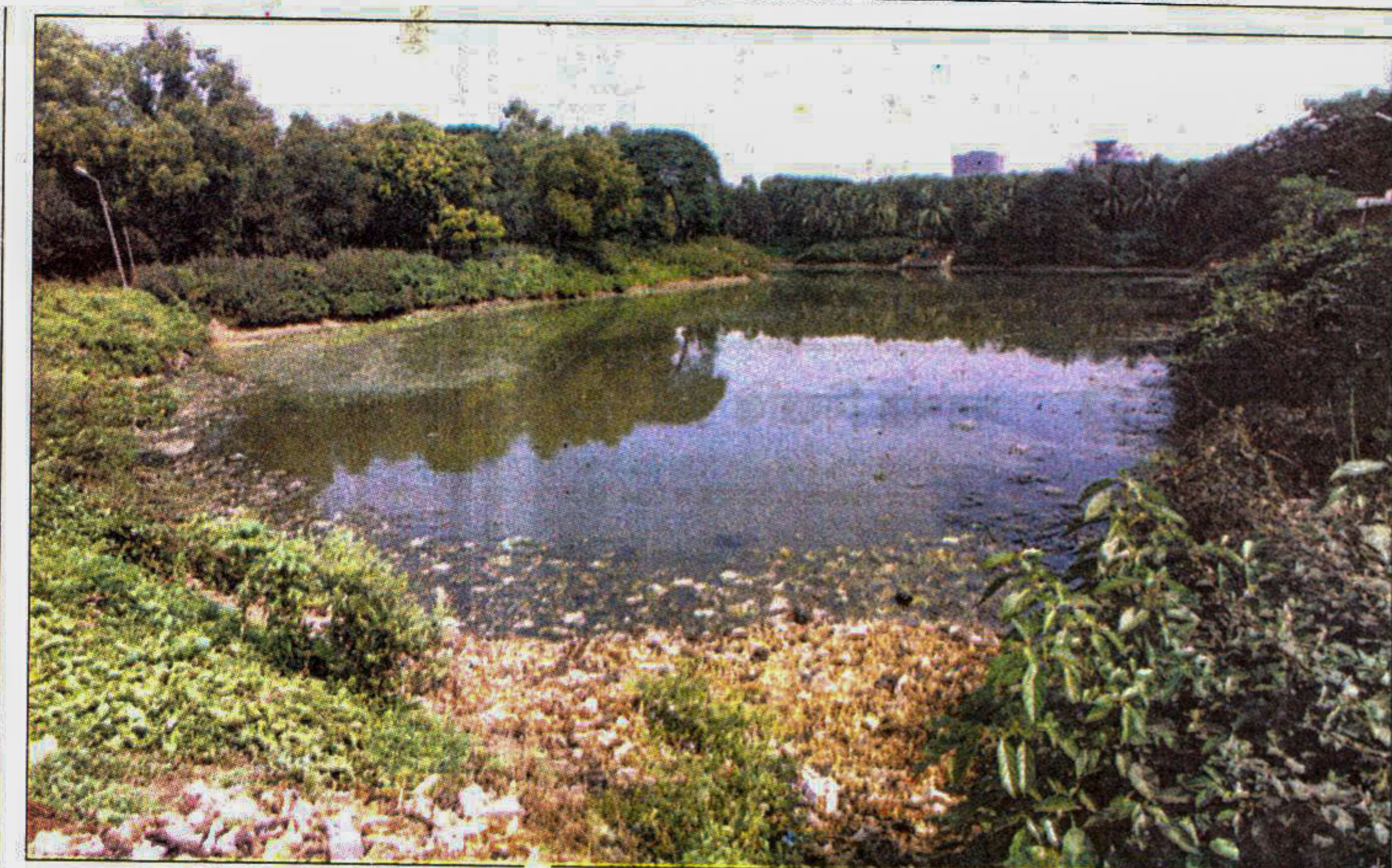
The trees at the Osmany Udyan are saved, at least for the time being, but the park remains endangered. The pond at the Udyan has been at the receiving end of a sewerage network. DCC wisdom! (Bottom left) A chirping bird, but how long will the winged beauty continue to buck the odds?