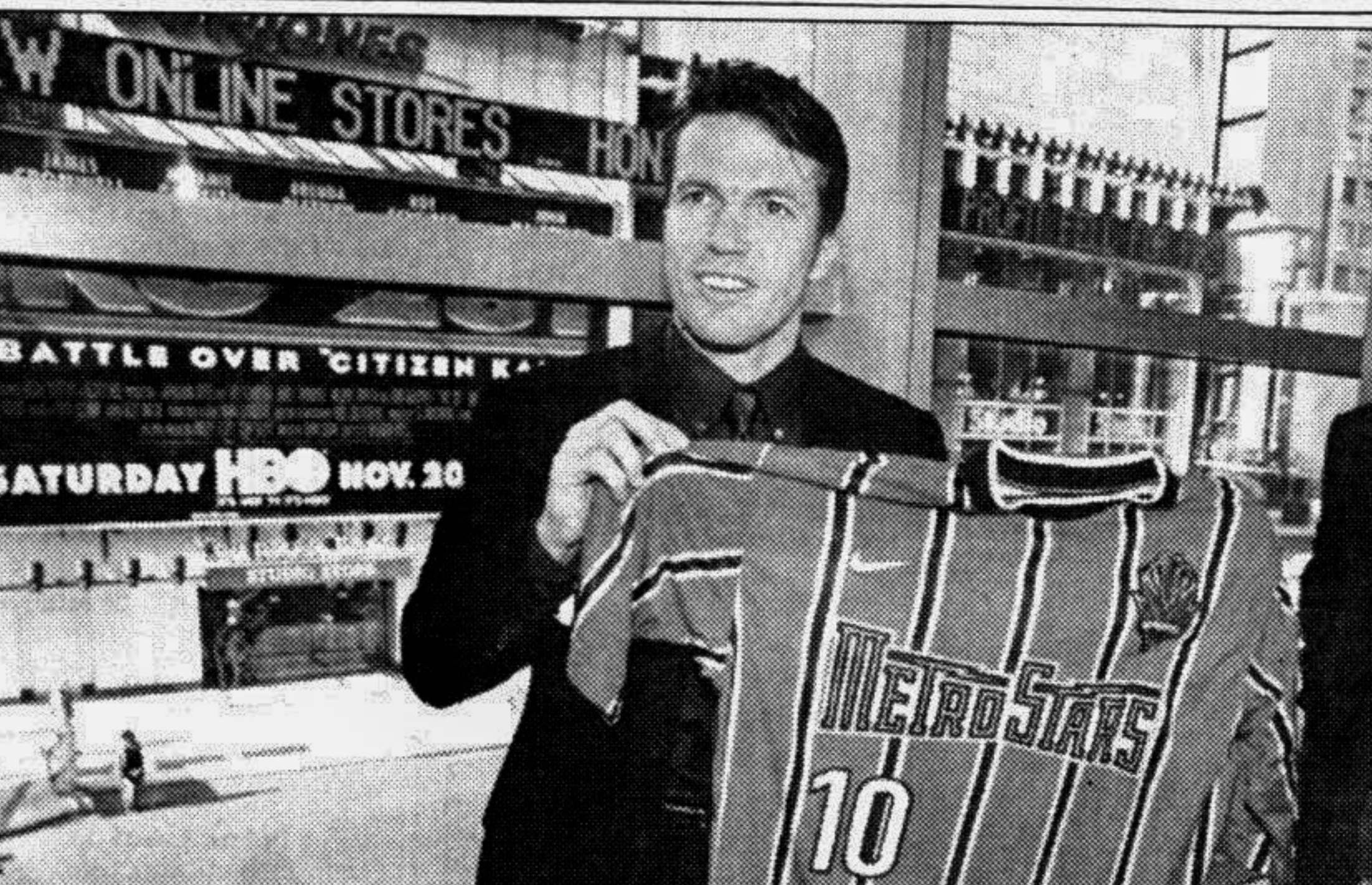
German football icon Lothar Matthaeus displaying his No 10 shirt of the New York/New Jersey MetroStars team during a media conference in New Jersey on November 9.