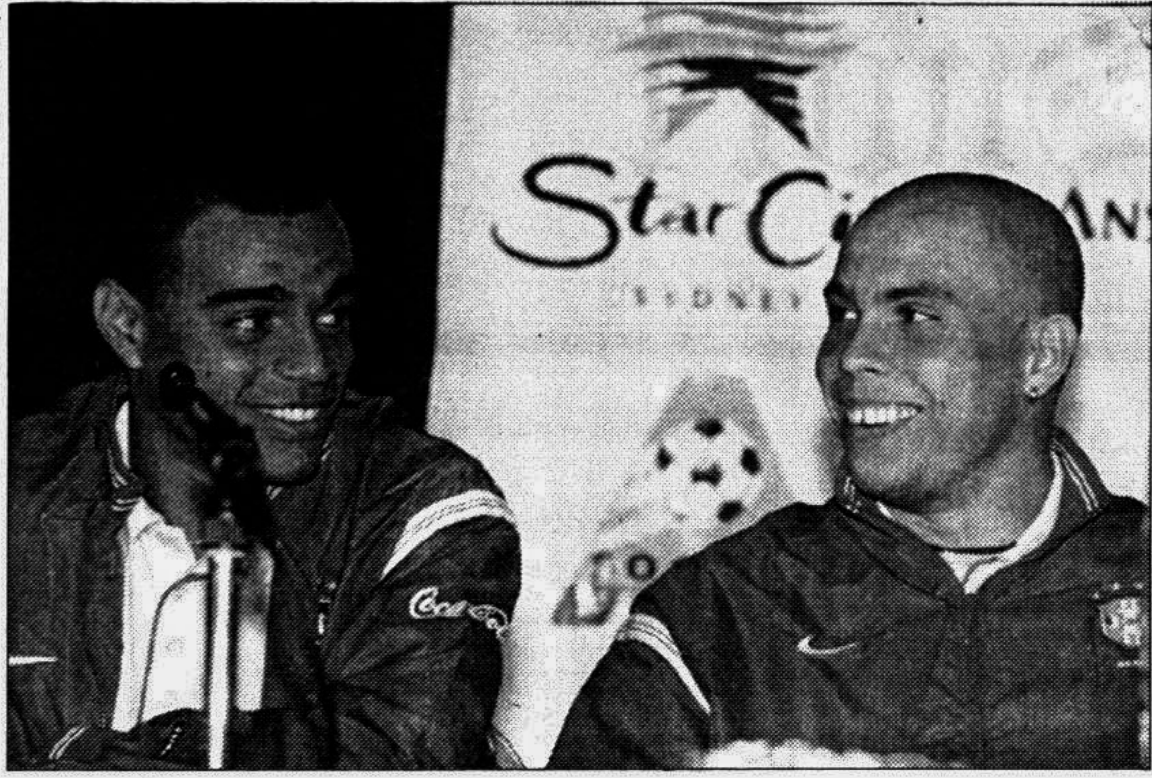
60 MILLION PLUS SMILES: Brazilian superstar Ronaldo (L) and Denilson, who have cost their respective clubs in excess of 60 million dollars, attending a press conference at Sydney yesterday. Brazil play Australia in two friendly internationals on November 14 and 17.

Russell Arnold made Sri Lanka's top score of 75 and off-spinner Andy Whittall was the best of the Zimbabwean bowlers with a career-best six for 151.