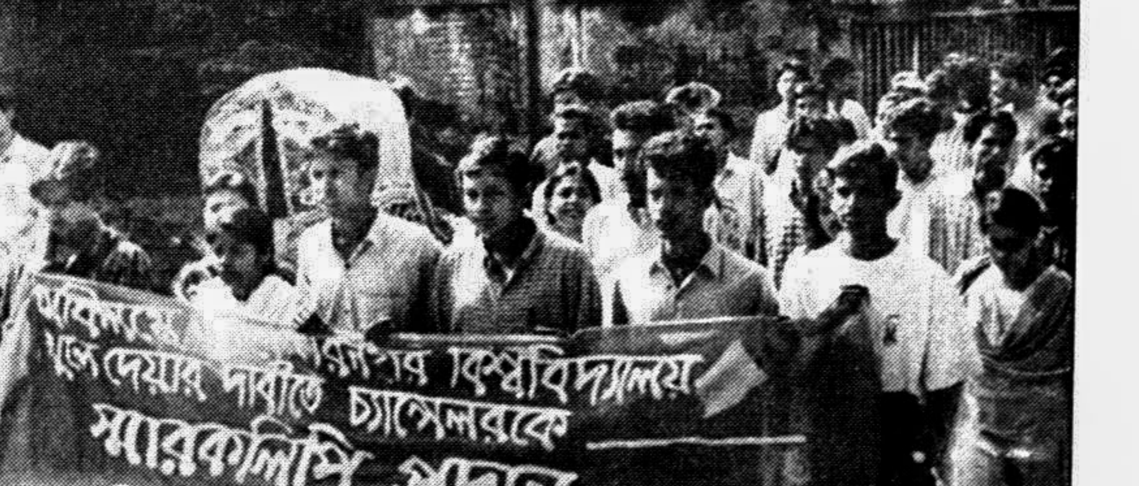
Members of Increased Fee Resistance Council of Jahangirnagar University brought out a procession on the JU campus yesterday to demand immediate reopening of the university.