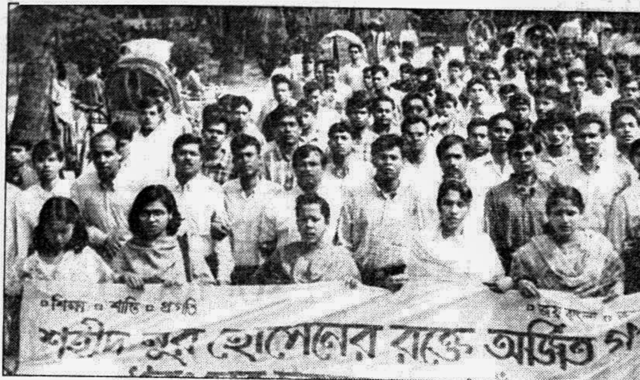
Bangladesh Chhatra League (BCL) brought out a procession on DU campus yesterday in observance of Shaheed Noor Hossain Day.

The 42nd death anniversary of Major A Ghani, the founder of The East Bengal Regiment, will be observed today. On this day in 1957 this valiant son of the soil popularly known as 'Tiger Ghani' whose memorable deeds of valour are recounted every day with great respect and honour died, says a press release.