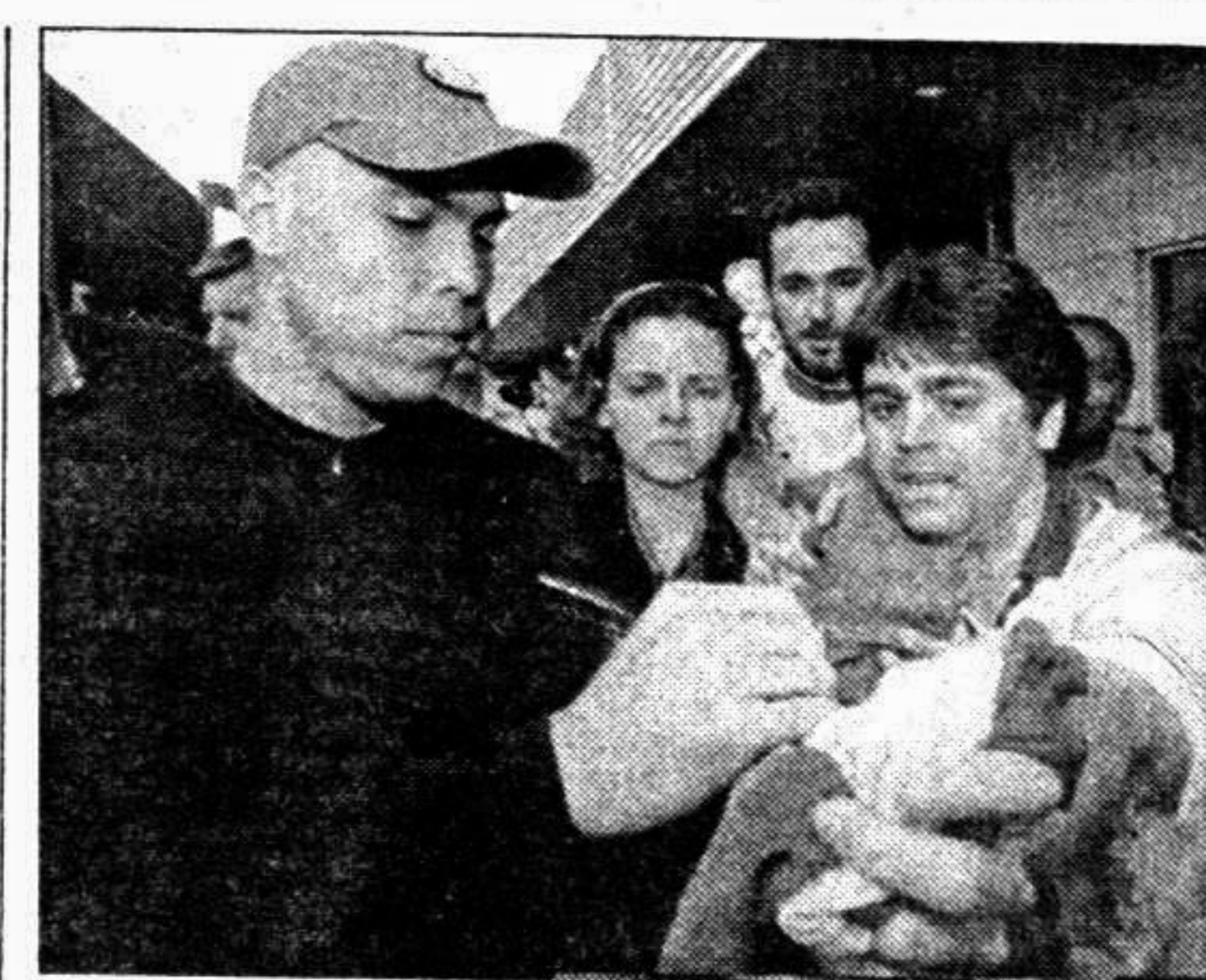
Ronaldo signs autographs on arrival at Sydney International Airport yesterday.

It's an absolute disgrace for our country, then German Chancellor Helmut Kohl said at the attack, reflecting widespread dismay in a country which has not had a bad record of soccer hooliganism in recent years.