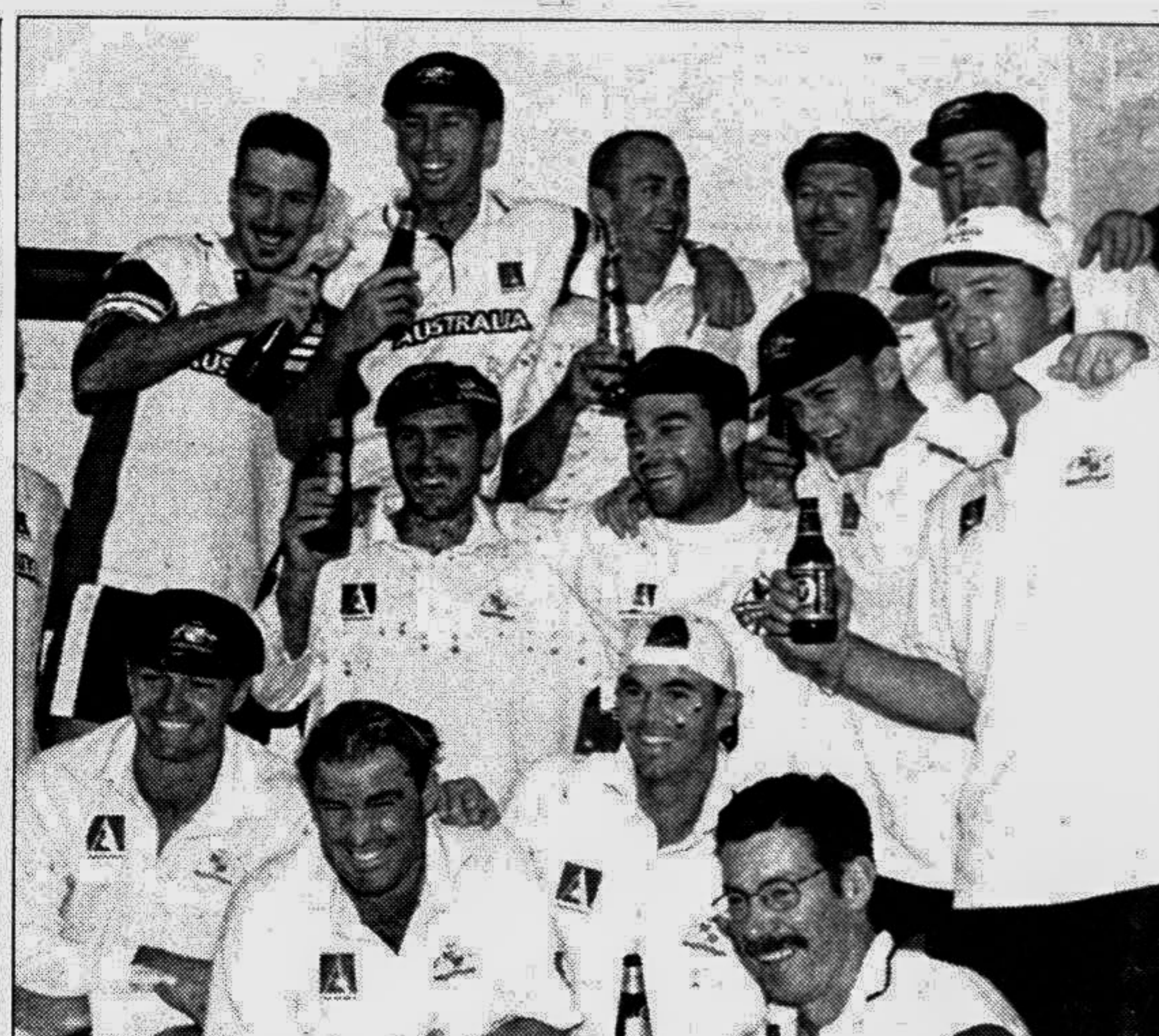
Australian cricketers celebrate after winning the Brisbane Test.

Akram drew positives from the team's batting where opener Saeed Anwar starred with 61