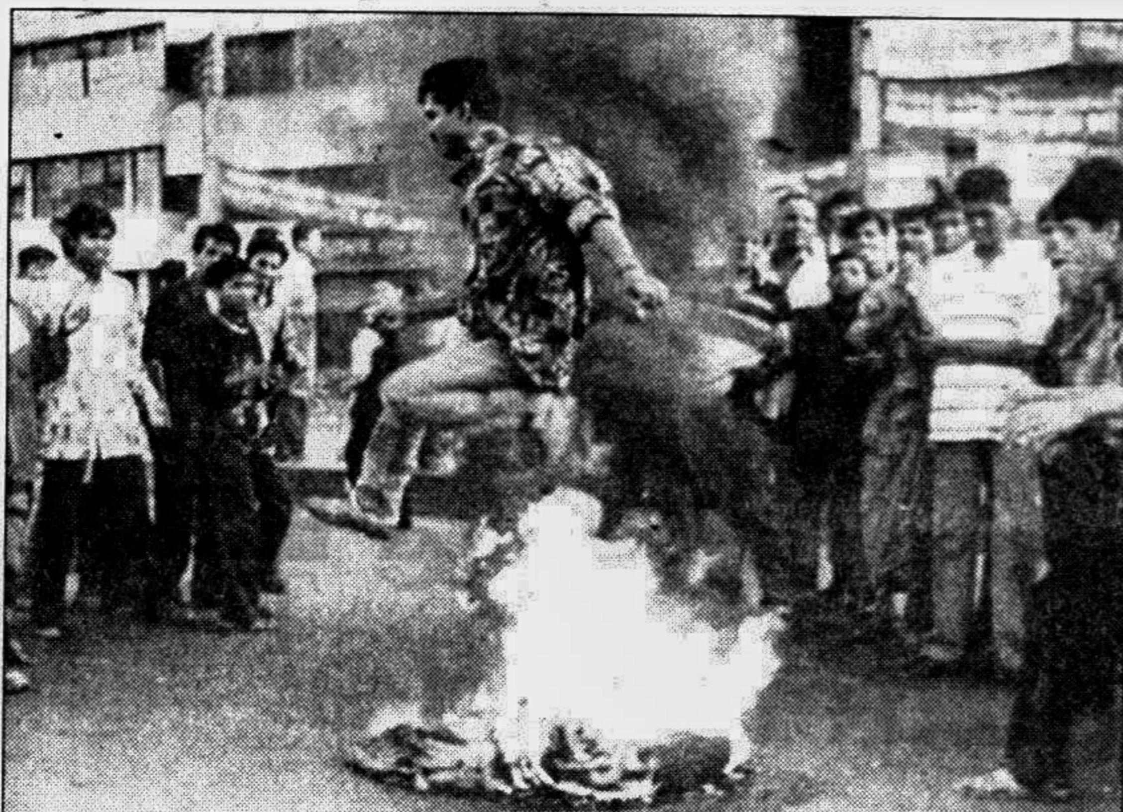
Pickets demonstrating in a different manner at a city road yesterday.