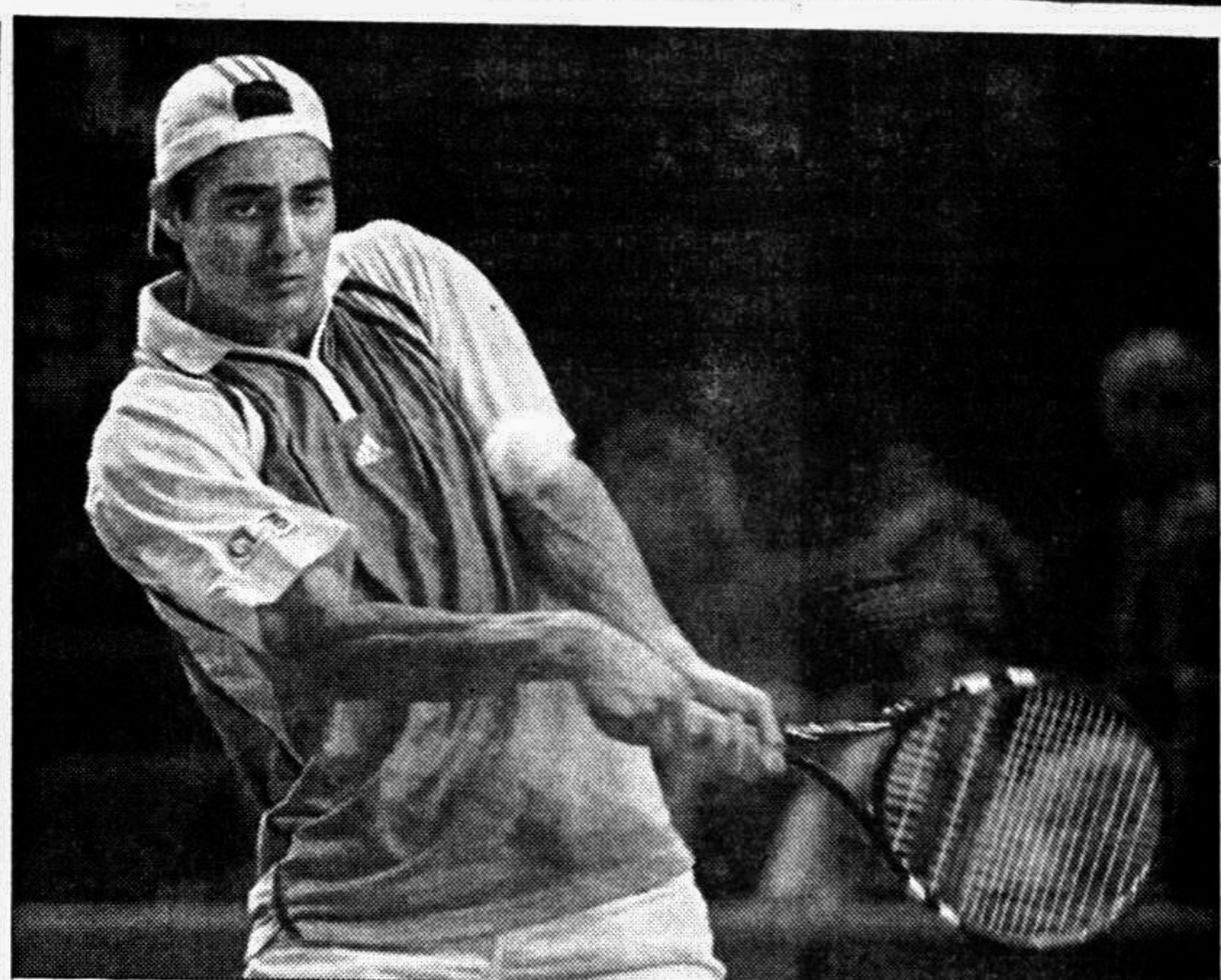
Ecuadorian Nicolas Lapentti in action against Germany's Tommy Haas in the quarterfinals of the Paris Open on November 5.