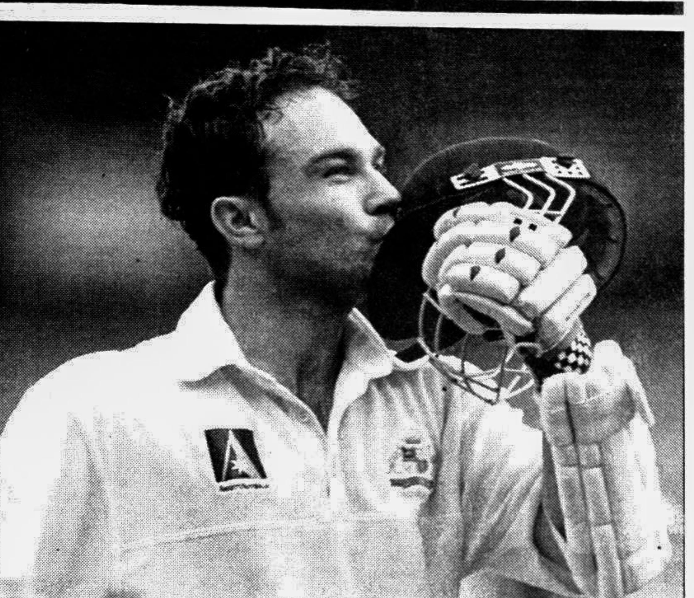
Century-maker Australian opener Michael Slater kisses his helmet after reaching the three-figure mark on the second day of the first Test against Pakistan in Brisbane