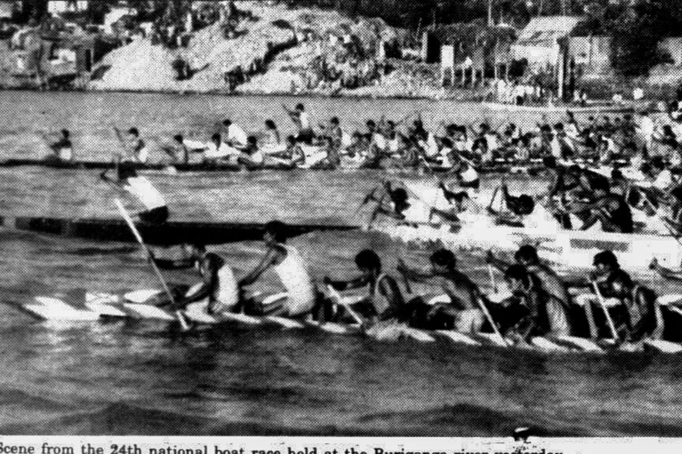
Scene from the 24th national boat race held at the Buriganga river yesterday.