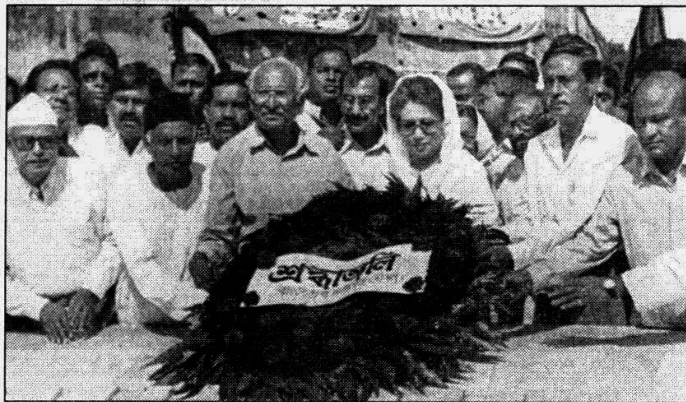
BNP chairperson Khaleida Zia placing wreaths at mazar of late president Ziaur Rahman yesterday on the occasion of 'National Revolution and Solidarity Day.'