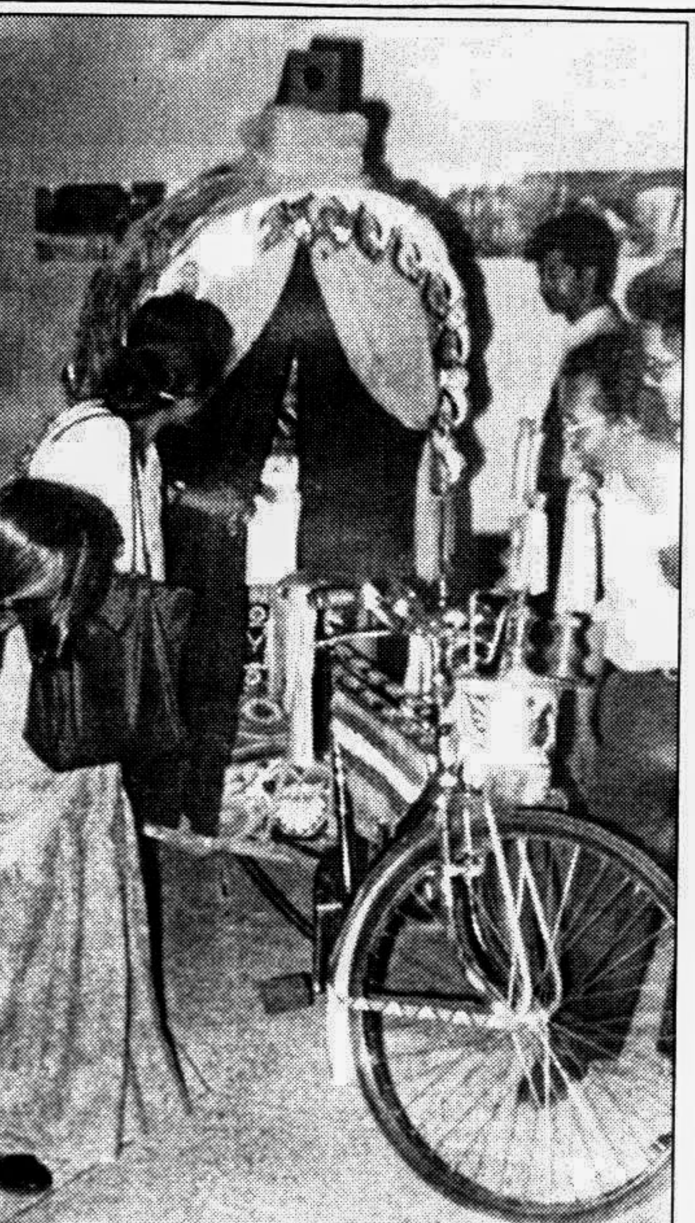
It is a rickshaw, but not one that you can take a ride on.

Four projects have been completed at a cost of about Tk 70 lakh under cluster village project at Ramgarh, Dighinala, Panchhari and Mohalchhari thanas.