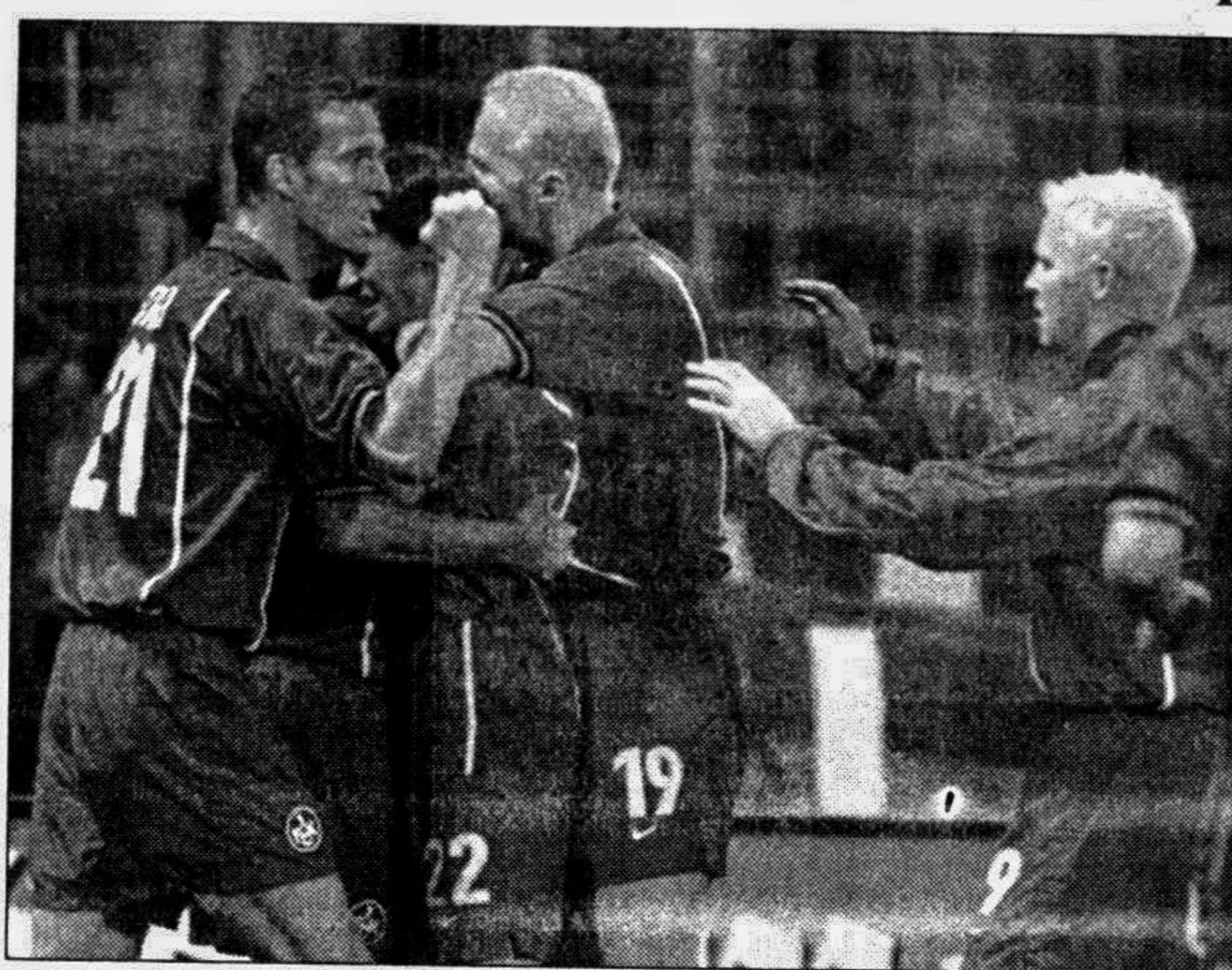
Kaiserslautern players celebrate their victory over Tottenham Hotspurs in the UEFA Cup in Kaiserslautern on November 4.

A Saudi delegate due to accompany Blatter on his tour decided to withdraw from the trip because it included a stop in Israel, an Emirati newspaper said Wednesday.