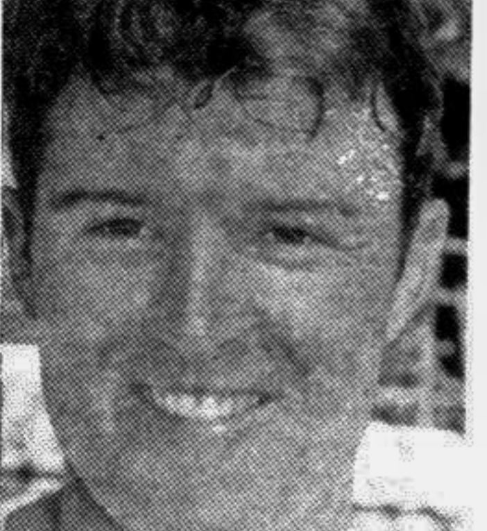
ASTLE ... m-o-m

Left-hander Twose, flown in for the one-dayers after being