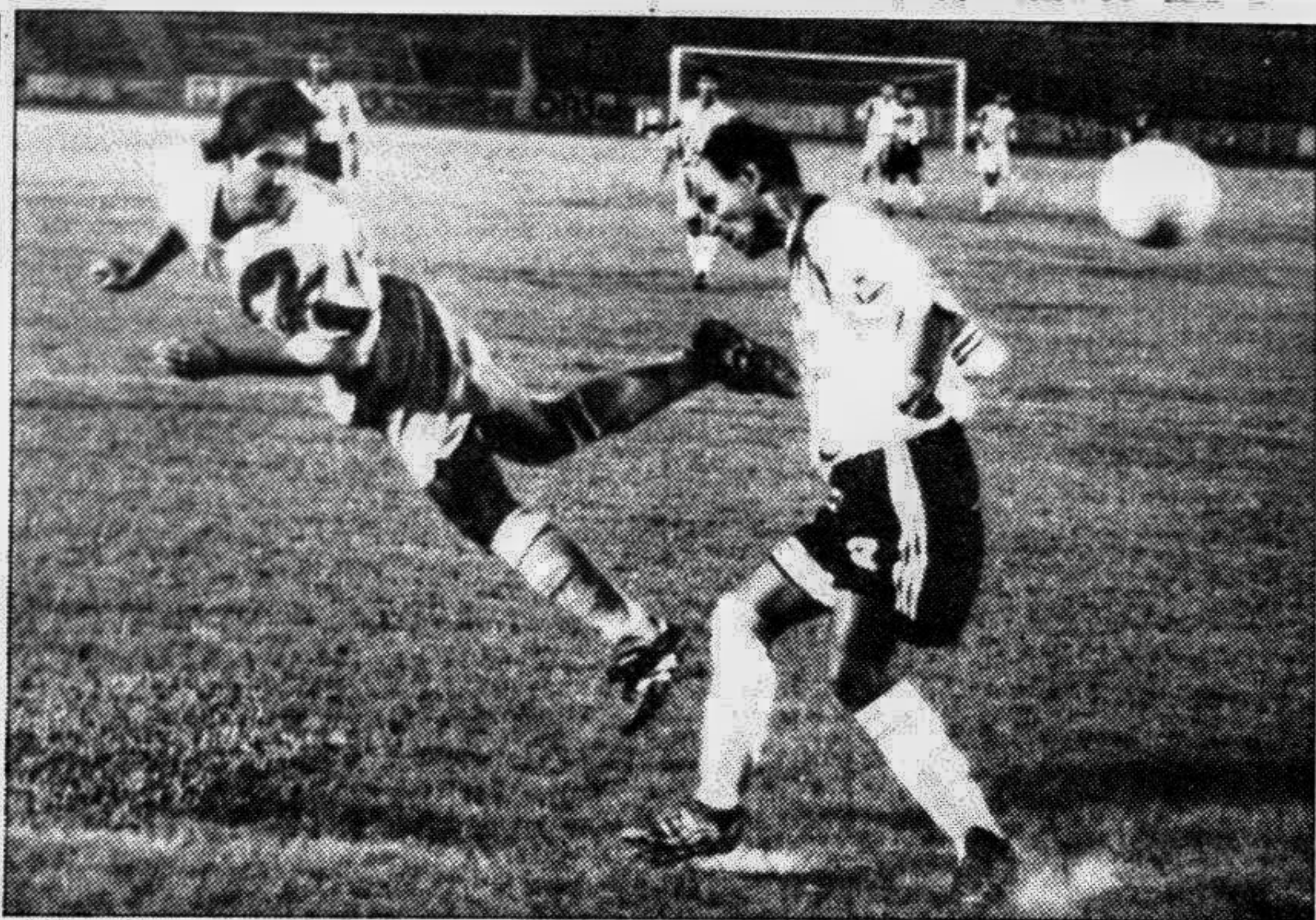
Action from yesterday's Premier Division football league match between Abahani and Arambagh at the Mirpur Sher-e-Bangla National Stadium.