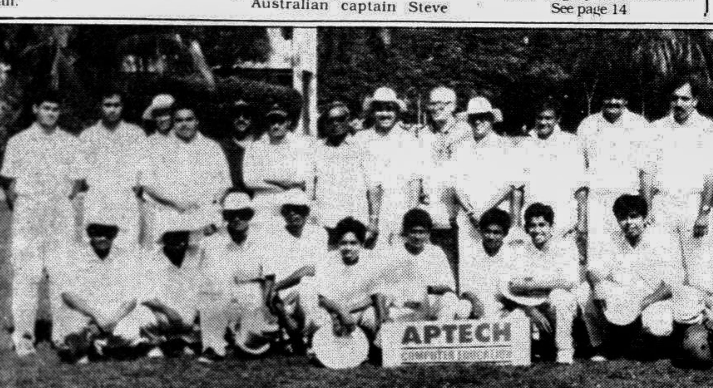
Players of both Green and Gold teams of Notre Dame College and officials pose for photographs just before the start of the Aptech Cup friendly cricket match at the college ground yesterday.

UNDATED, Nov 5 (AFP/Reuters): As news of Malcolm Marshall's death spread across the world, the international tributes started to pour in today. "He was as good as they come," said former England batsman David Gower talking on BBC radio. "Basically, he held sway from the early 80s. Throughout the decade he was the main man. He had a great ability not just to bowl quick but, what makes it worse for the batsman, the ability to do a lot with the ball." "He could swing the ball, move the ball. An intelligent bowler sums it up nicely. He was hugely talented, naturally talented, whippy, wiry, strong," said Gower. "He enjoyed bowling very quickly (but) he didn't always bowl flat out when conditions didn't merit it. Even at say Old Trafford on a slow wicket he could get wickets when the ball wasn't doing much off the pitch." "He built up a formidable understanding of how to bowl quick and when." Australian captain Steve Waugh said he was "totally shocked" by the news. Waugh, whose early Test career corresponded with matches against the fearsome Marshall, paid tribute to the Caribbean speedster. "I'm totally shocked," he said after Friday's opening day of the first Test against Pakistan here. "I walked in for lunch and saw there was a special on the television about Malcolm Marshall and I was amazed to find out that he was dead." "It's a tragedy for cricket, especially for the Caribbean." — See page 14