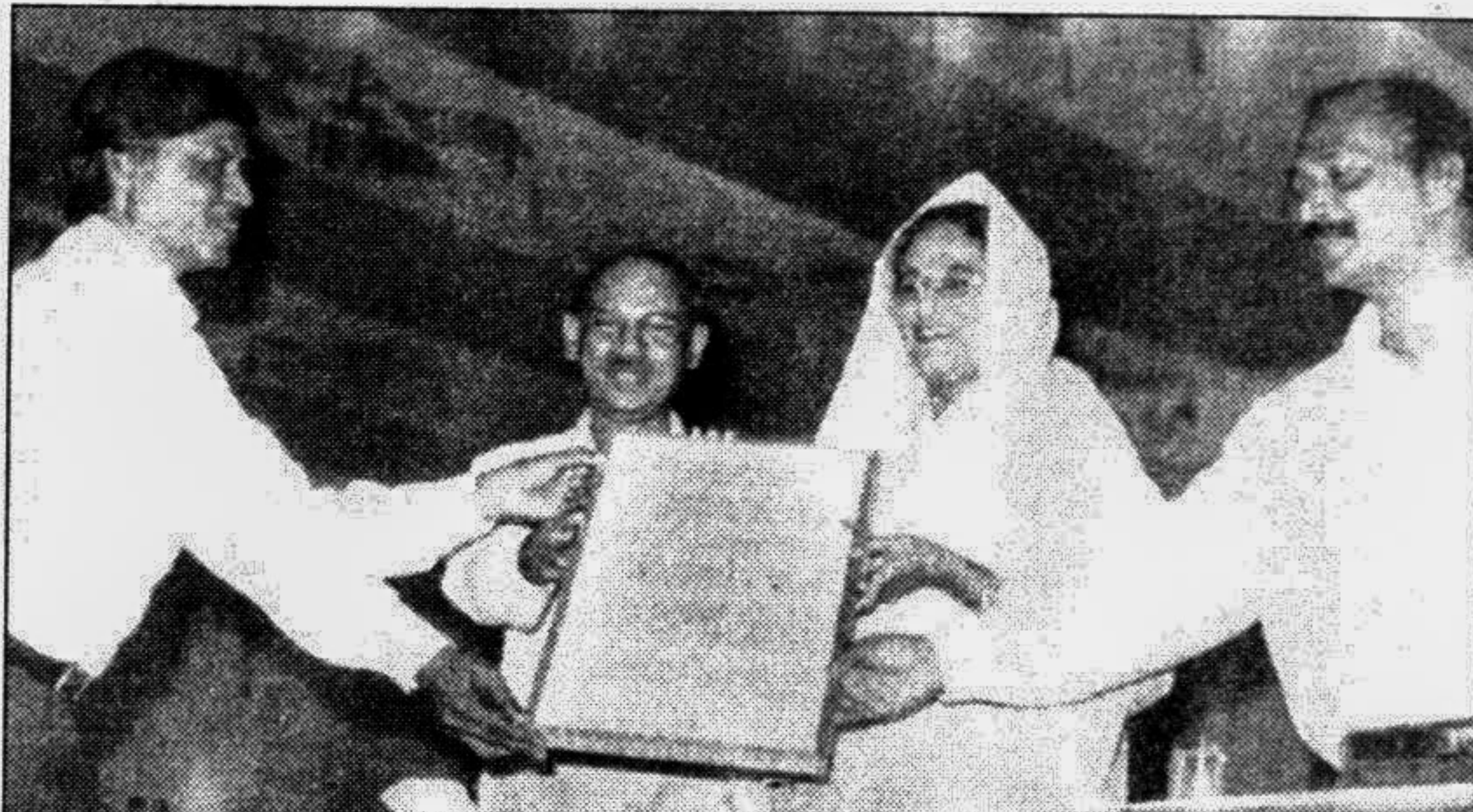
Prime Minister Sheikh Hasina was accorded a reception jointly by the Bangladesh Federal Union of Journalists (BFUJ) and the Dhaka Union of Journalists (DUJ) at the Jatiya Press Club yesterday on her winning the UNESCO peace award.