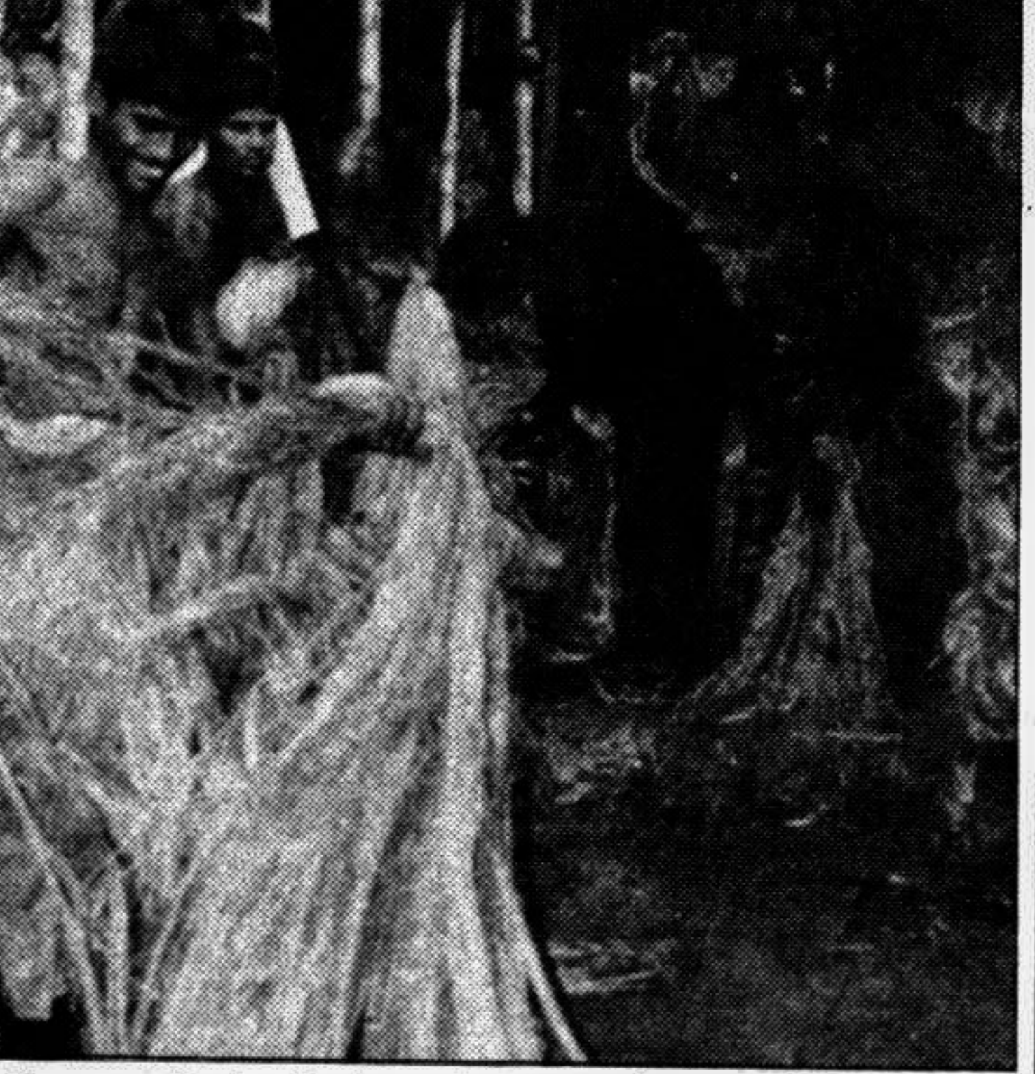
Growers display their products at a jute-purchase centre in Magura town recently. Farmers said they are selling the crop below the production cost. At present, jute sells between Tk 280 and Tk 340 a maund in local markets.

The sources said 346 cases were lodged during the period.