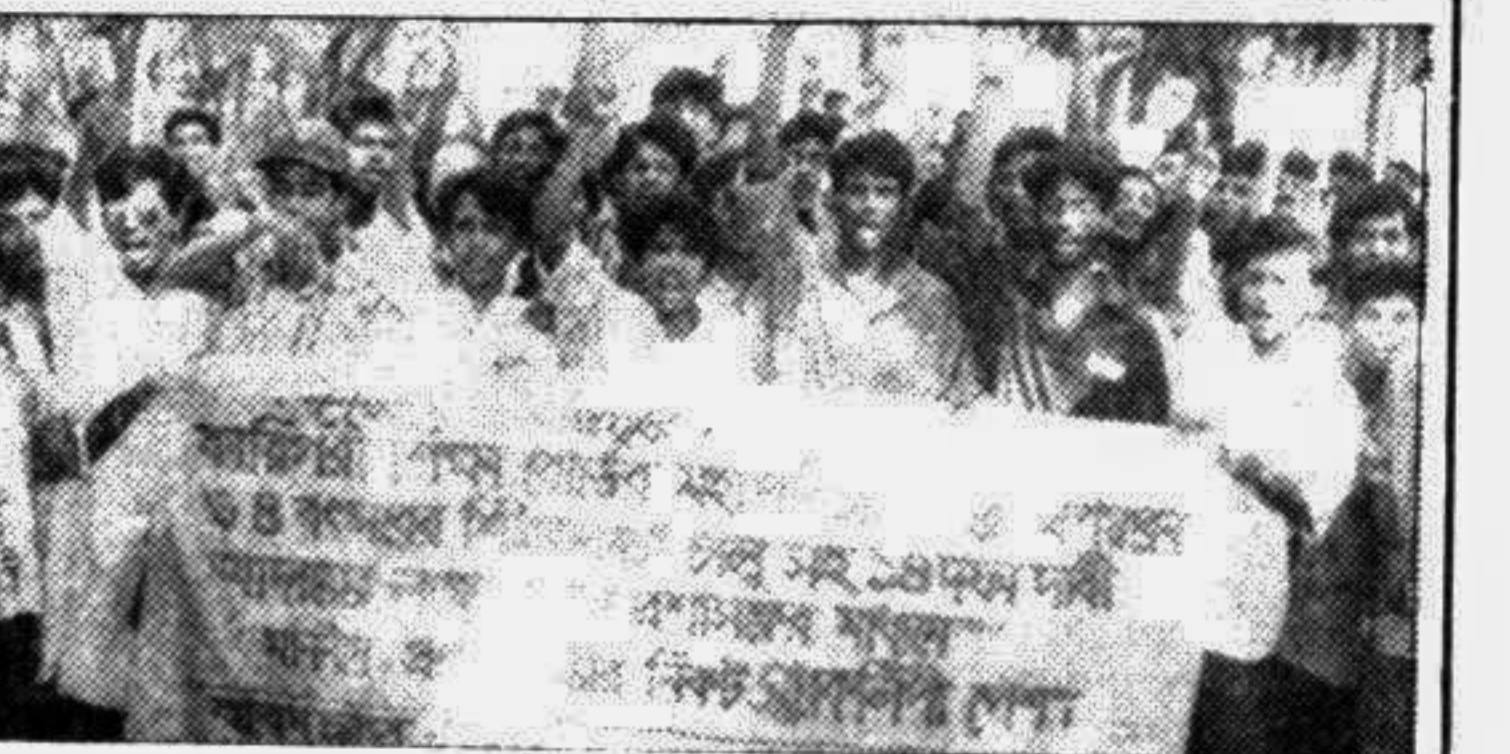
The students of Rangpur Polytechnic Institute brought out a rally in Rangpur town recently demanding fulfilment of their 14-point charter of demands including removal of DG of Technical Education Board and introduction of 4-year technical education course.