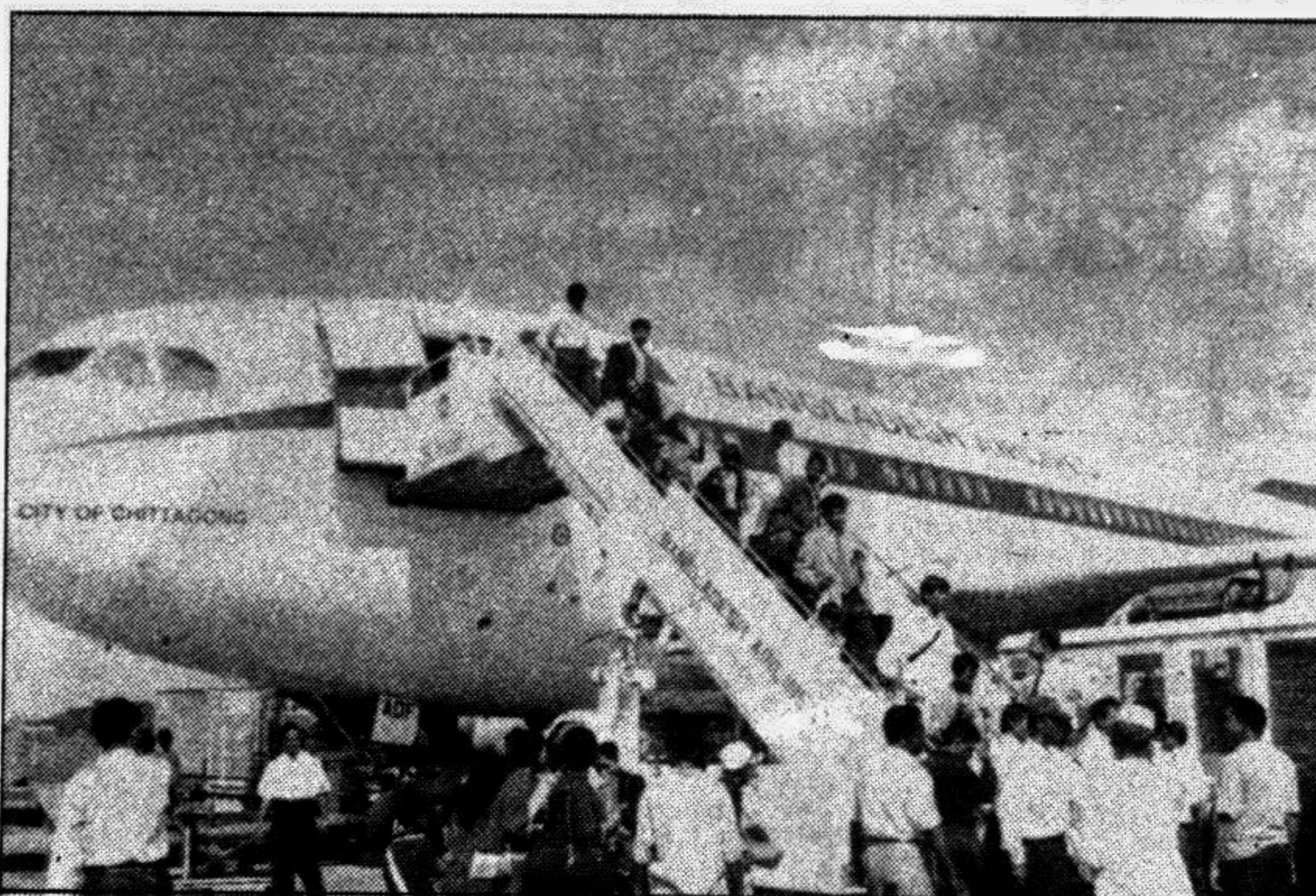
Passengers of the first London-Sylhet direct Biman flight disembark as the inaugural flight lands at Osmani International Airport in Sylhet on Thursday. The national carrier will operate the flight twice a week with wide-bodied aircraft.

Police and hospital sources said the fighting was a sequel to quarrel over the lease of Karimganj hat. Supporters of Bepari and Sardar groups fought the battle that lasted about an hour. During the clash both sides used fire weapons. About 50 gunshots were fired injuring at least 20 people. Both the groups filed case against each other.