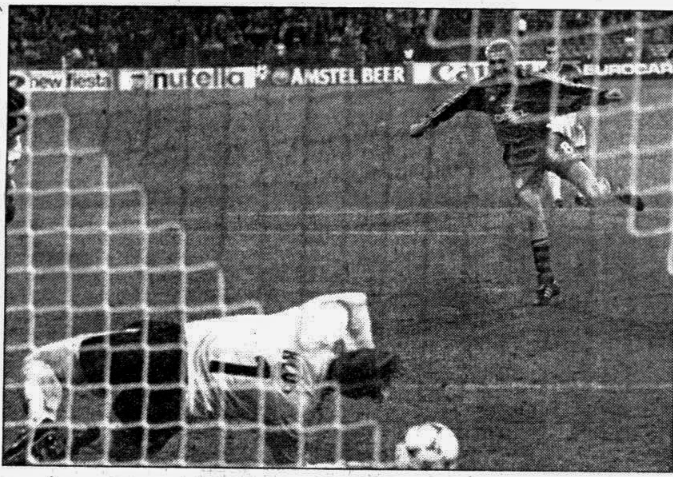
Bayern Munich's Thomas Strunz scores from the spot against Glasgow Rangers during the Champions' League fixture on Wednesday.

The opening Test puts the spotlight on the top-four Australian batsmen - Michael Slater, Greg Blewett, Justin Langer and Mark Waugh.