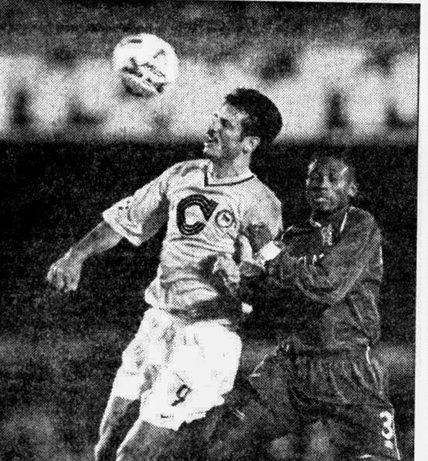
Hertha Berlin's Iranian striker Ali Daei (L) fights with Celestine Babayaro of Chelsea for possession during their Champions' League clash at Stamford Bridge on November 3.

Tuttosport commented: "Chelsea did their duty right to the very end by beating Hertha."